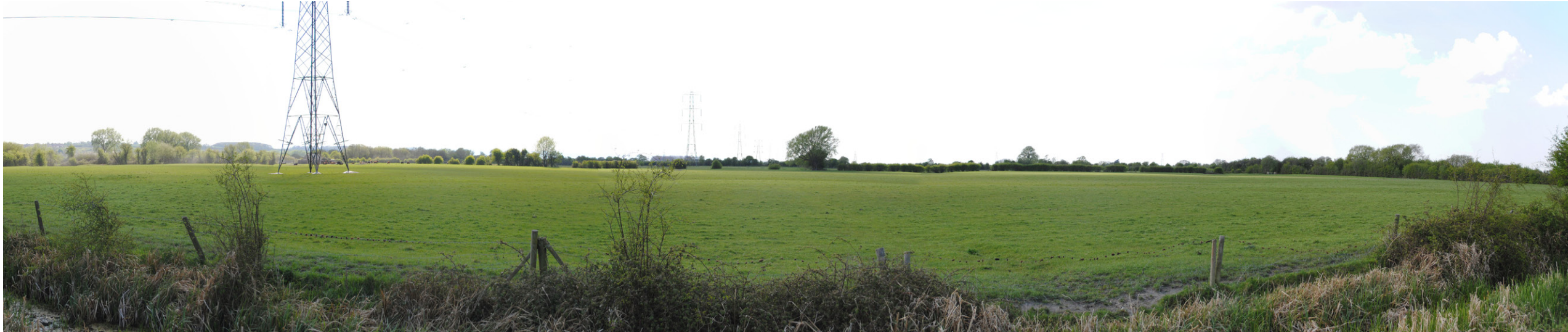
Photograph B1.13: Existing view from PRow BW 37/11 looking westwards across farmland along the ZG Route towards the F Route and the route of the proposed 400kV overhead line