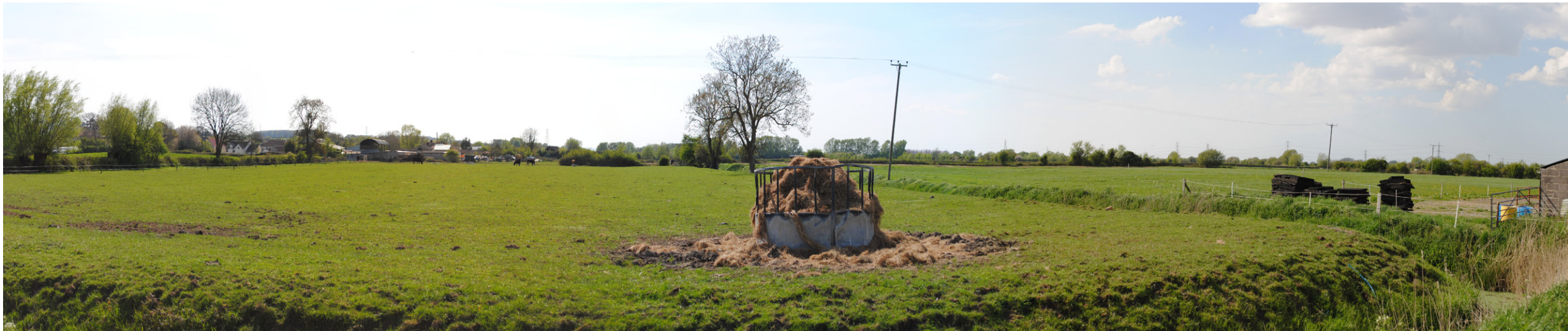
Photograph B1.11: Existing view from PRow BW 37/10, north of Reeds Drive, Woolavington looking westwards across fields divided by ditches towards the F Route and the route of the proposed 400kV overhead line