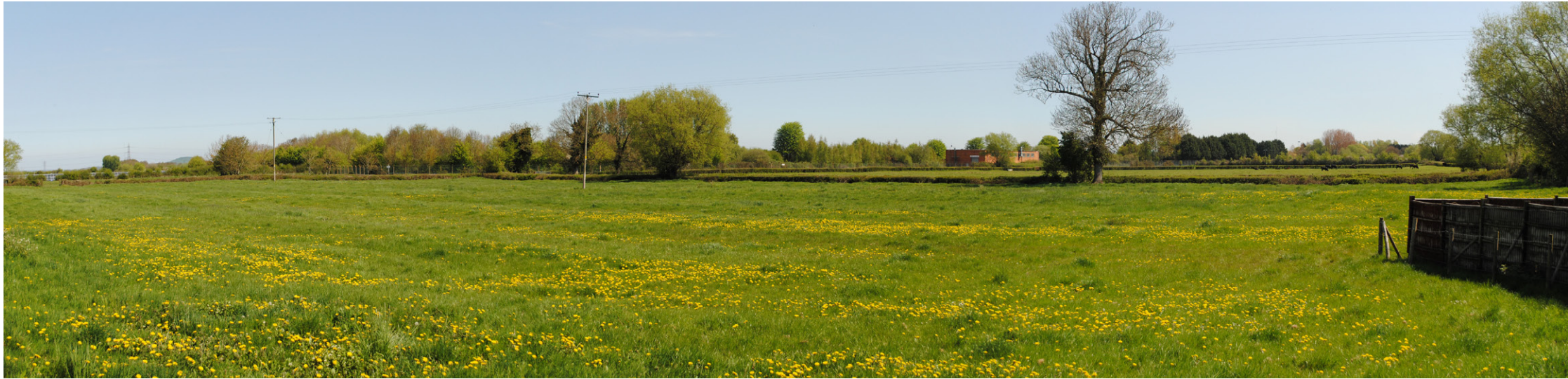
Photograph B1.4: Existing view from Rookery Close, Puriton looking north and east across farmland on Puriton Level towards the route of the proposed 400kV overhead line beyond the former Ordnance Factory site