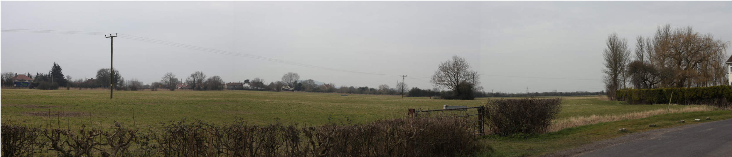
Photograph B1.94: Existing view from the southern part of Biddisham Lane near adjacent properties, looking east and southeast towards the F Route and the route of the proposed 400kV overhead line beyond farmland and above and between intervening field boundary hedgerow and trees