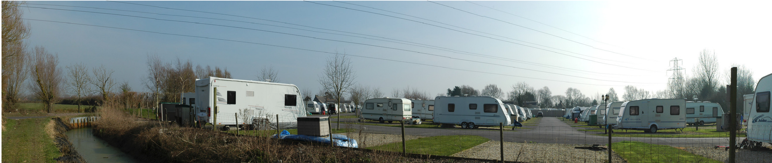
Photograph B1.52: Existing view from PRow AX 23/11 looking northeast to southwest towards the F Route passing over Coombes Caravan Park