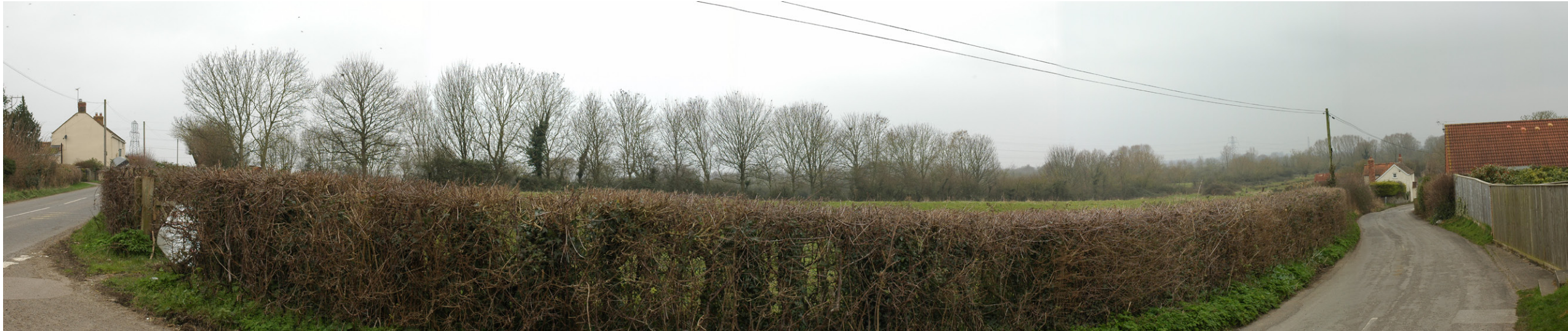
Photograph B1.1: Existing view from Crockers Hill, Woolavington looking southwest, west and northwest towards the F Route screened in places by intervening field boundary trees