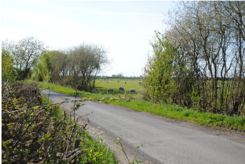
Photograph B1.22: Existing view from Burtle Road and National Cycle Route 33, near Red House, looking northwest across farmland on Huntspill Moor towards the route of the proposed 400kV overhead line and the F Route beyond