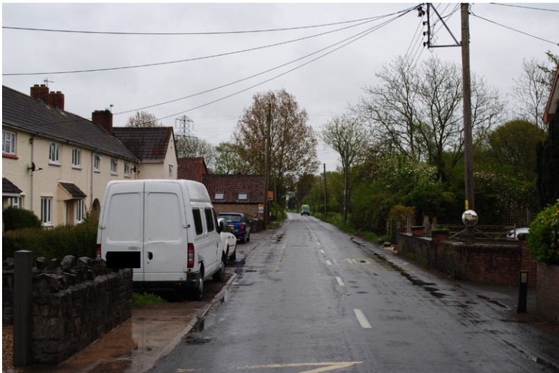
Photograph B1.55: Existing view from the B3139 Mark Causeway looking east towards the F Route passing over and immediately north of Mark Causeway