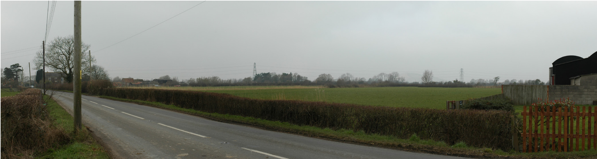
Photograph B1.48 (Part 2): Existing view from Mark Causeway near Court Farm looking south to north towards the route of the proposed 400kV overhead line passing over Mark Causeway and adjacent fields