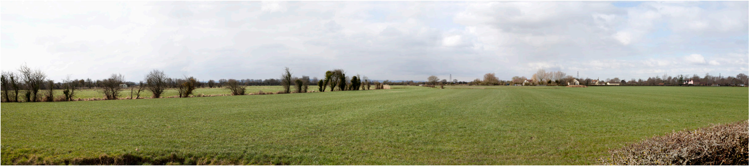
Photograph B1.41: Existing view from Butt Lake Road south of Mark Causeway looking southwest towards the route of the proposed 400kV overhead line across flat farmland and towards the F Route beyond