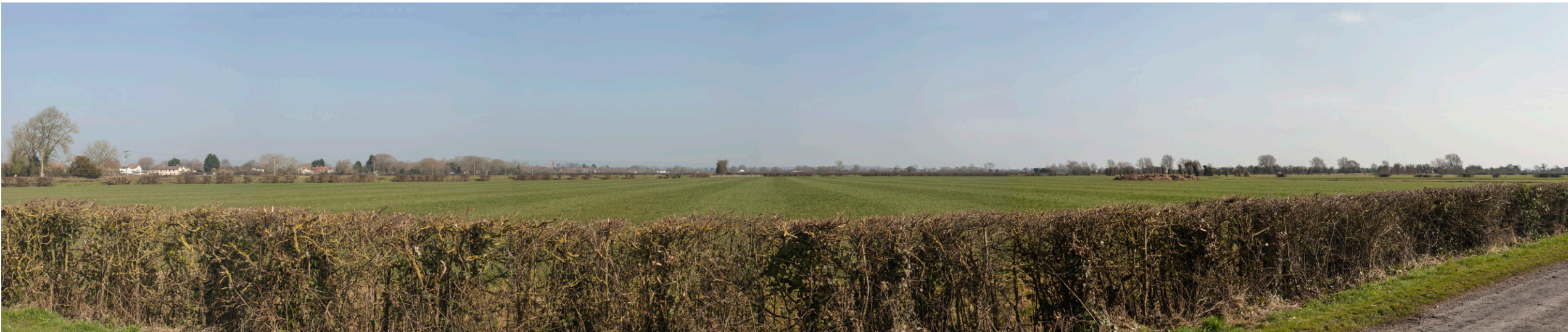
Photograph B1.40: Existing view from Yardwall Road south of Mark Causeway looking east across fields towards the route of the proposed 400kV overhead line with Mark Church perceptible in the distance