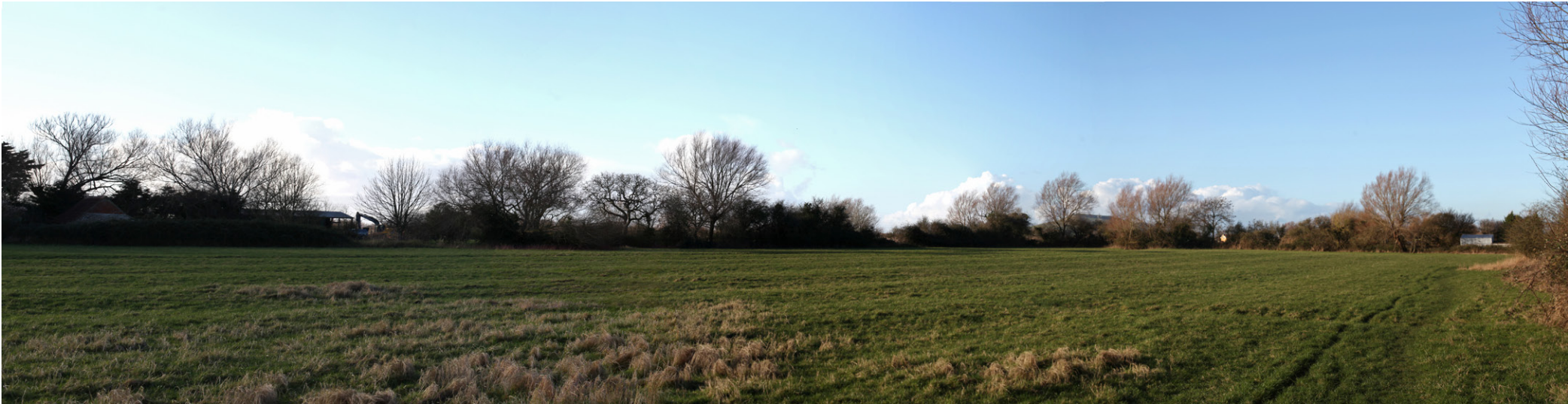
Photograph B1.49: Existing view from PRow AX 23/4 looking west and northwest towards the route of the proposed 400kV overhead line and the F Route beyond intervening farmland and hedgerow