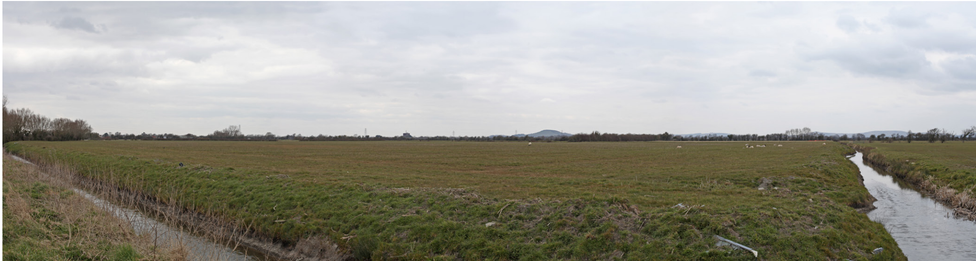
Photograph B1.21: Existing view from Burtle Road and National Cycle Route 33 east of Cote looking northwest and north towards the route of the proposed 400kV overhead line across Huntspill Moor and towards the F Route beyond