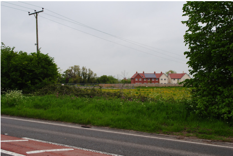
Photograph B1.83: Existing view from the A38 Bristol Road (near residential properties north of the A38) looking southeast towards the F Route and the route of the proposed 400kV overhead line in the distance beyond fields and new housing on Pill Road