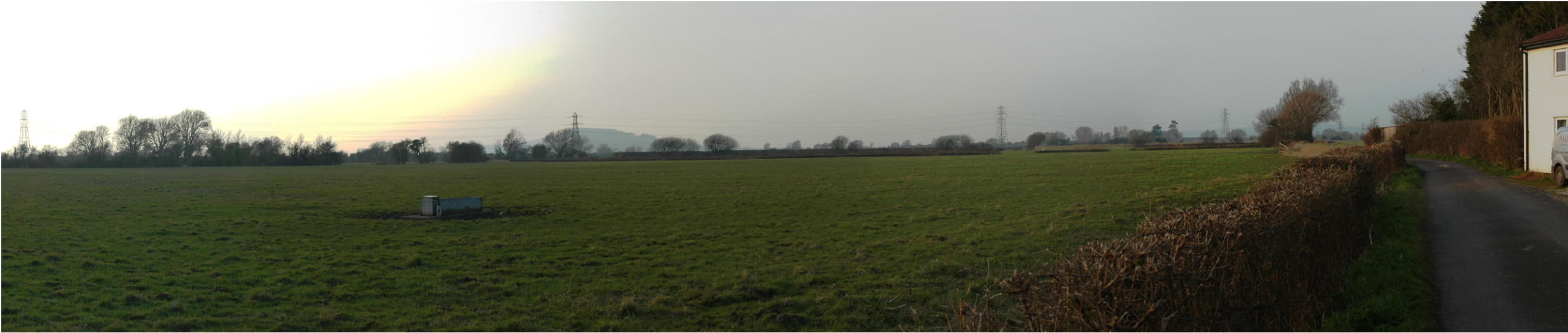
Photograph B1.61: Existing view from the road adjacent a property named Wellfield Farm looking southwest to north across farmland towards the F Route and the route of the proposed 400kV overhead line