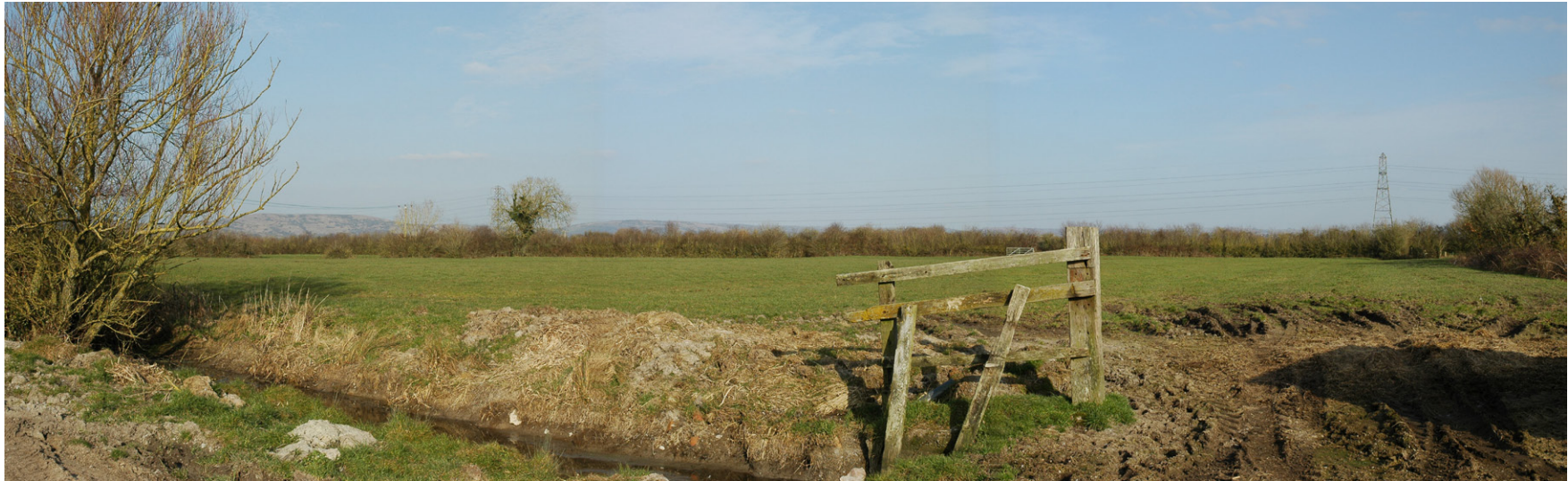
Photograph B1.79: Existing view from PRow AX 17/12 south of Gills Lane looking east across fields towards the F Route and the route of the proposed 400kV overhead line between intervening field boundary hedgerow and trees