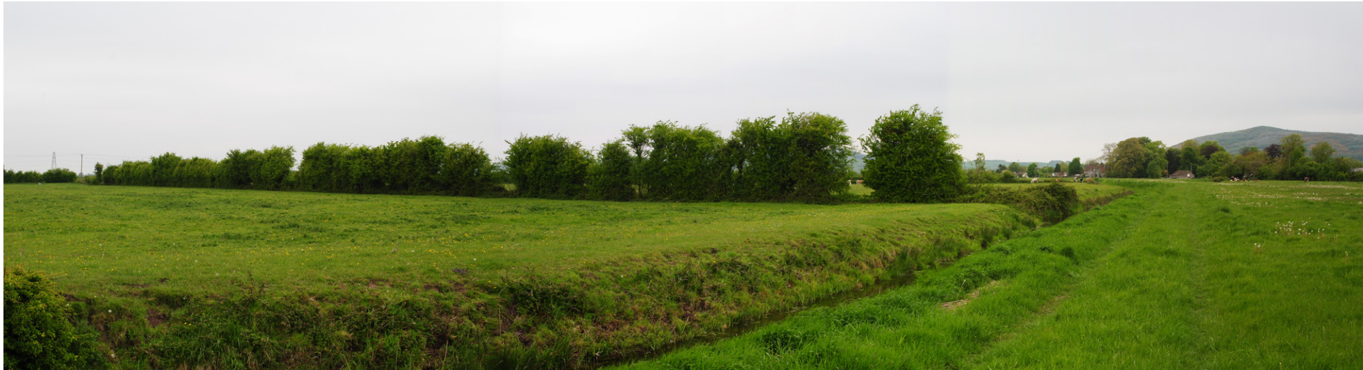
Photograph B1.96 (Part 2): Existing view from PRow AX 2/9 looking southwest to north towards the F Route and the route of the proposed 400kV overhead line beyond farmland and above intervening field boundary hedgerow and trees