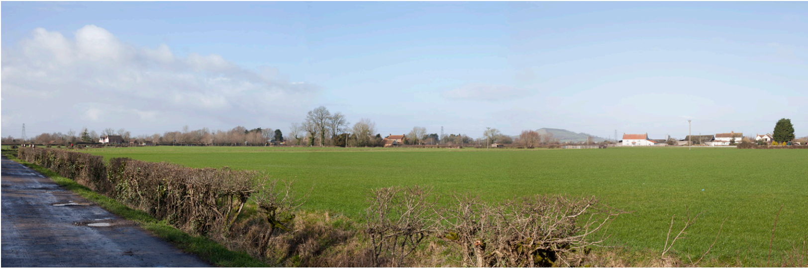
Photograph B1.42: Existing view from PRow AX 23/5 on Green Drove south of Mark Causeway looking northwest towards the route of the proposed 400kV overhead line across flat farmland and towards the F Route beyond