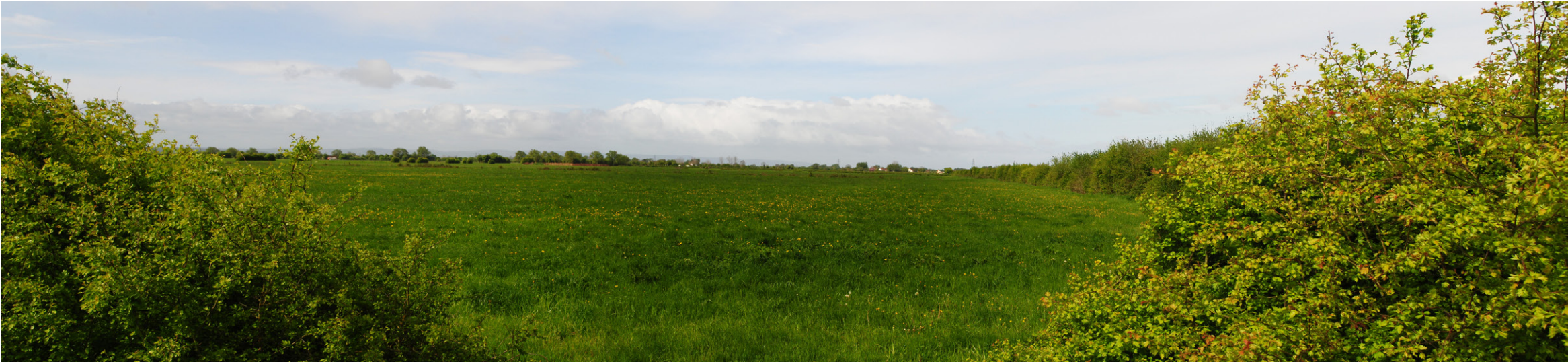
Photograph B1.45: Existing view from PRow AX 23/5 looking west across farmland towards the route of the proposed 400kV overhead line in the distance