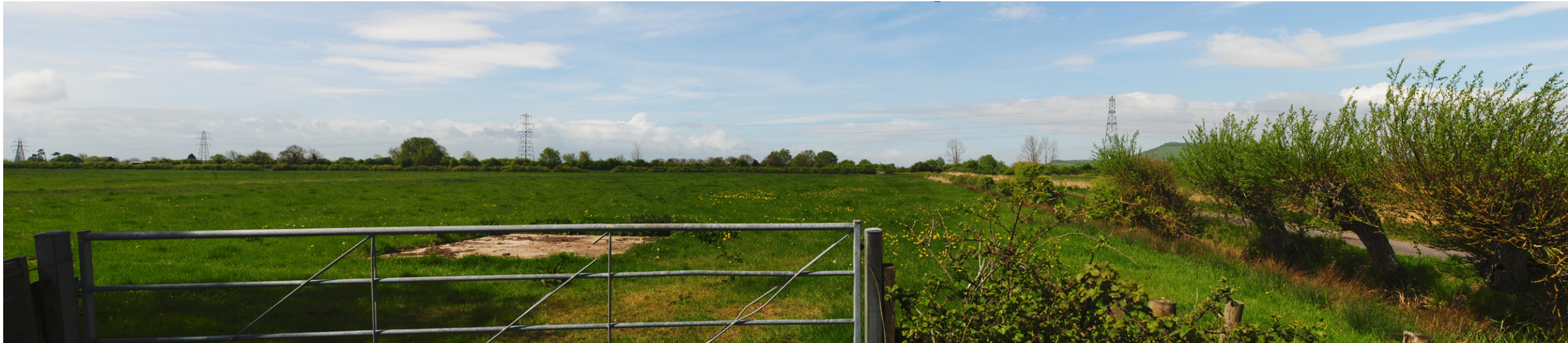
Photograph B1.74: Existing view from PRow AX 17/30 on Pillrow Wall looking southwest and west across fields towards the route of the proposed 400kV overhead line and the F Route beyond