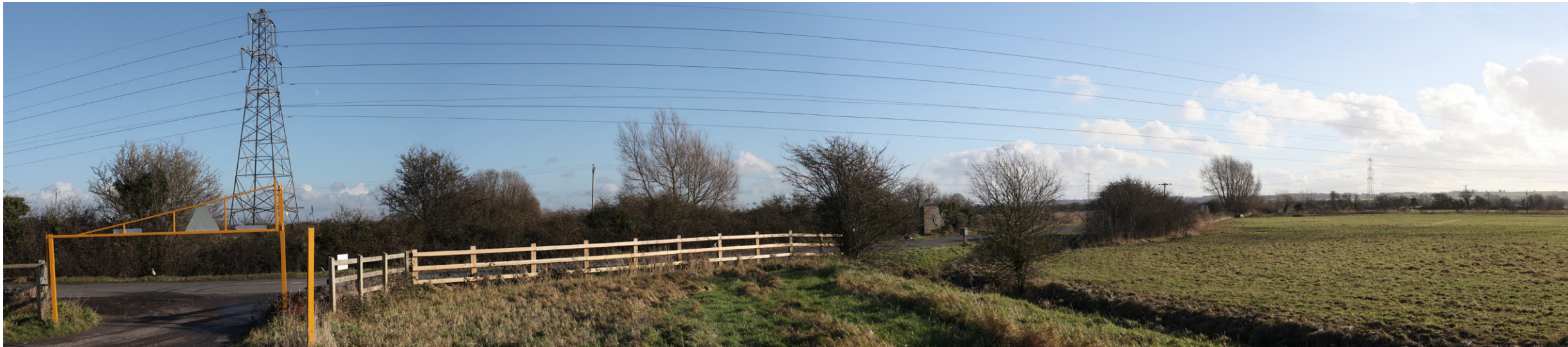
Photograph B1.18c: Existing view from the car park adjacent to the B3139 Causeway and the Huntspill River, looking east and southeast towards the F Route and the route of the proposed 400kV overhead line, with the ZG Route beyond and Puriton Ridge in the distance