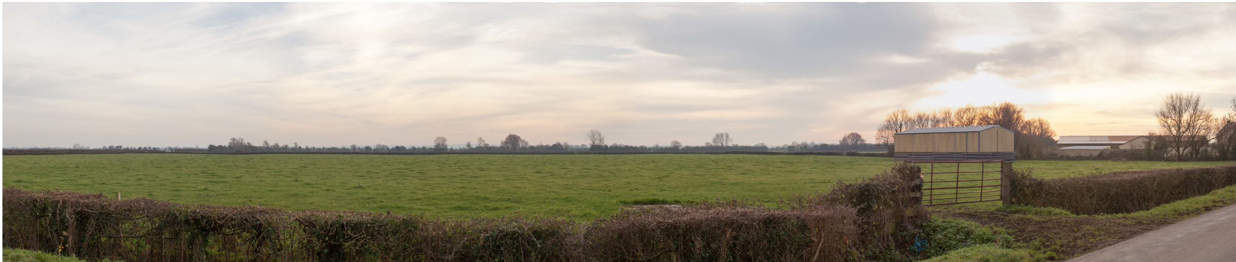
Photograph B1.35: Existing view from Southwick Road looking southwest to southeast across farmland towards the route of the proposed 400kV overhead line