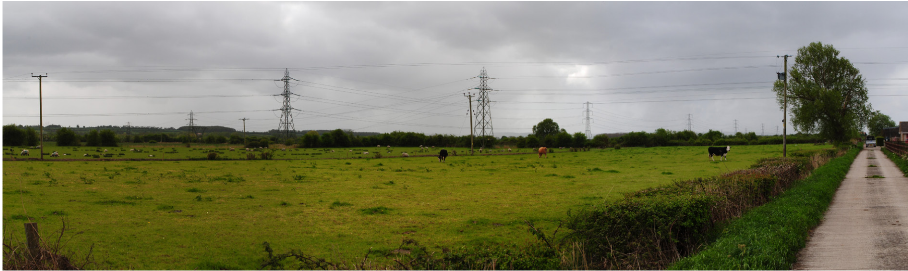
Photograph B1.16: Existing view from the B3139 Causeway at the entrance to Homestead Farm looking south and southwest across farmland towards the F Route and the existing 400kV Hinkley to Melksham overhead line where these lines cross on Woolavington Level