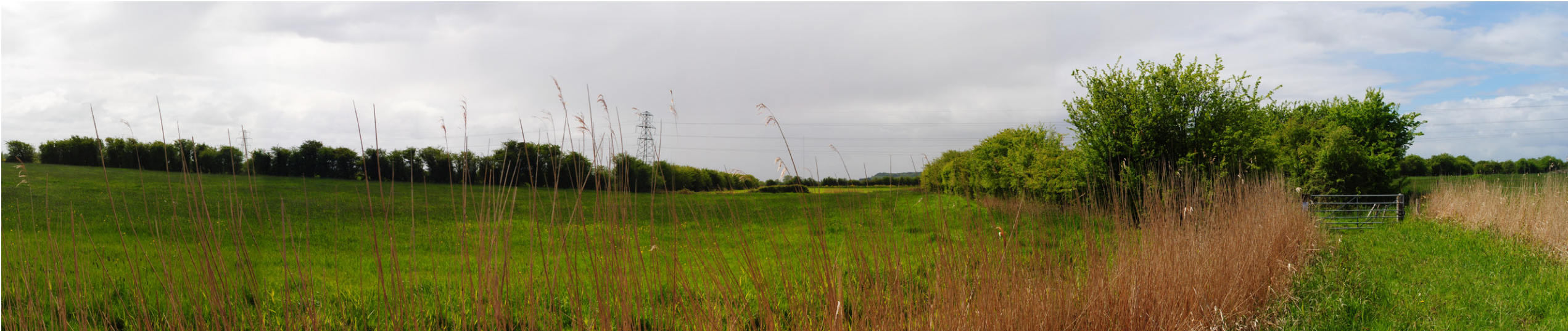
Photograph B1.77 (Part 1): Existing view from PRow AX 17/12 looking southwest to northwest across fields towards the route of the proposed 400kV overhead line and the F Route