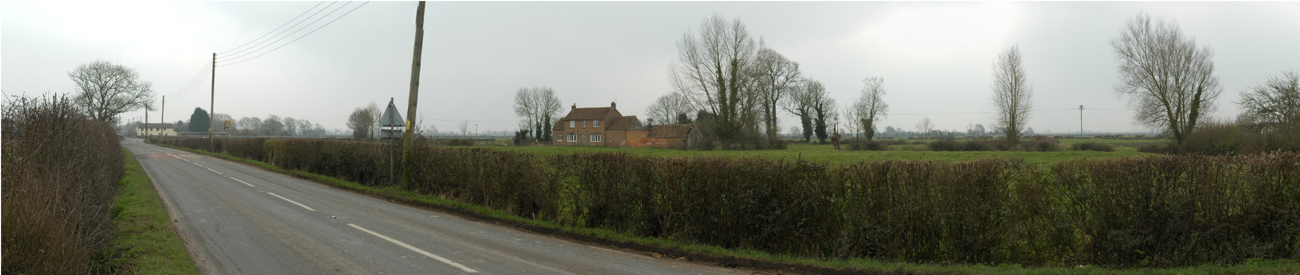
Photograph B1.46: Existing view from Mark Causeway looking east and south towards the route of the proposed 400kV overhead line passing over Mark Causeway and fields to the south of this road