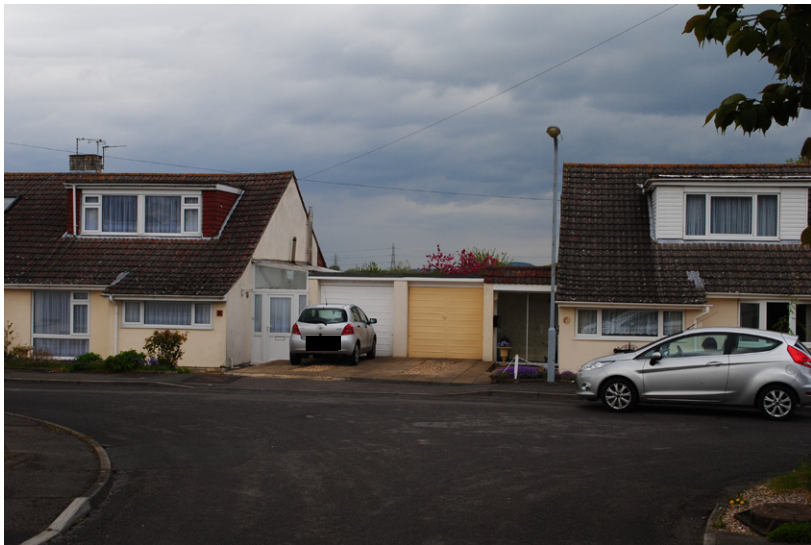
Photograph B1.6: Existing view from Mortimer Close, Woolavington looking north between residential properties towards the F Route and the route of the proposed 400kV overhead line running across Woolavington Level