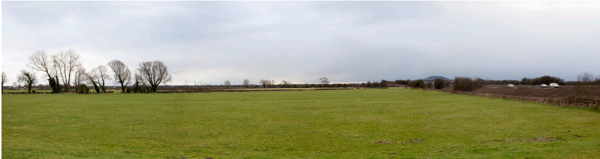
Photograph B1.108: Existing view from PRow AX 21/3 along the River Axe south of Loxton adjacent to the M5 motorway looking south across flat farmland along the F Route into the distance and towards the route of the proposed 400kV underground cables, the site of the proposed CSE compound and towards the route of the proposed 400kV overhead line beyond