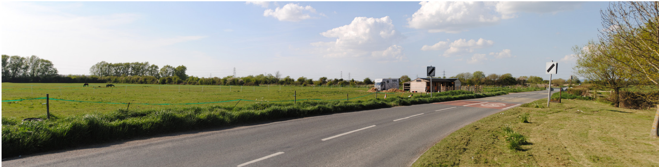
Photograph B1.8 (Part 2): Existing view from the B3139 Causeway, north of Pear Tree Farm, Woolavington, looking southwest, west and north across farmland on Woolavington Level towards the F Route and the route of the proposed 400kV overhead line