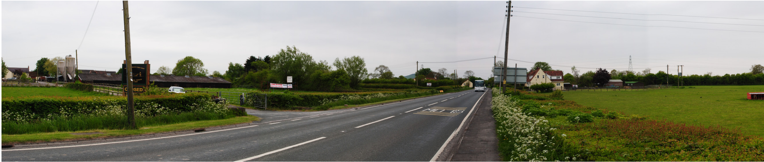
Photograph B1.91: Existing view from the A38 Bristol Road looking south to north towards residential property and farm buildings at Manor Farm, and towards the F Route and the route of the proposed 400kV overhead line across the A38 Bristol Road and across farmland