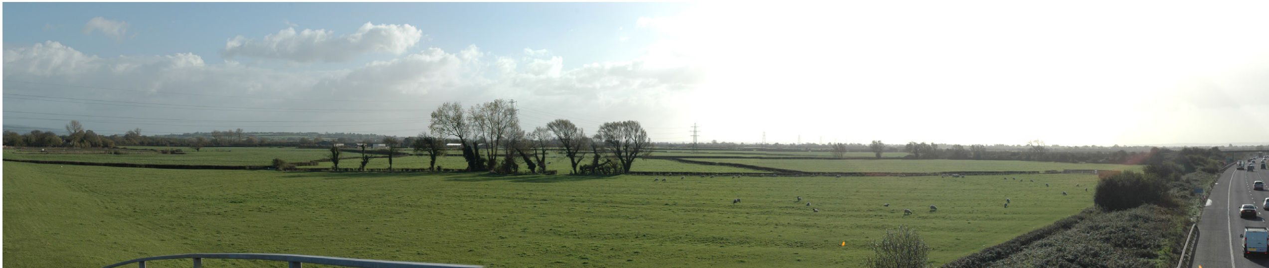
Photograph B1.110: Existing view from PRow AX 21/3 on the footbridge over the M5 motorway looking northwest to northeast along the motorway and towards adjacent tree cover and the F Route above to the south of the Mendip Hills