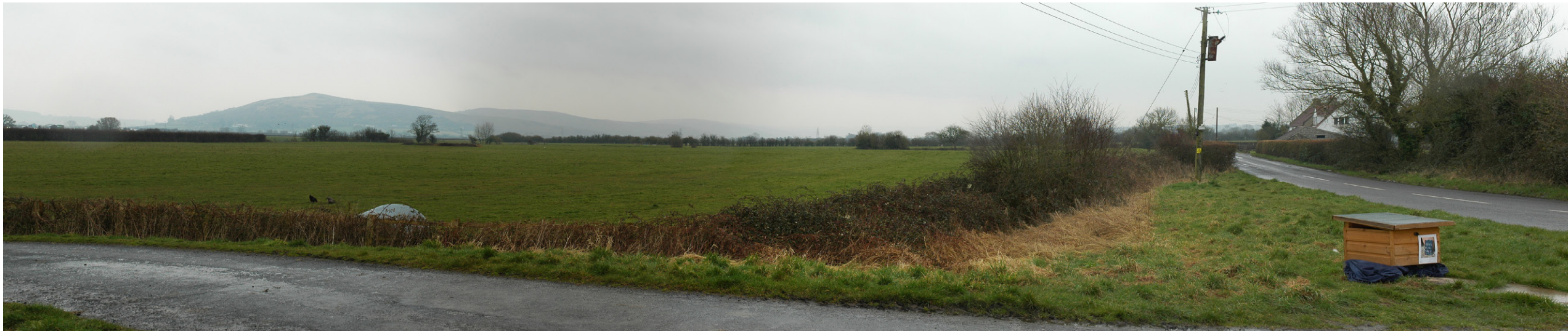
Photograph B1.101: Existing view from Rooksbridge Road near the entrance to York Farm looking north east to southeast towards the F Route and the route of the proposed 400kV overhead line beyond farmland and above and between intervening field boundary hedgerow and trees