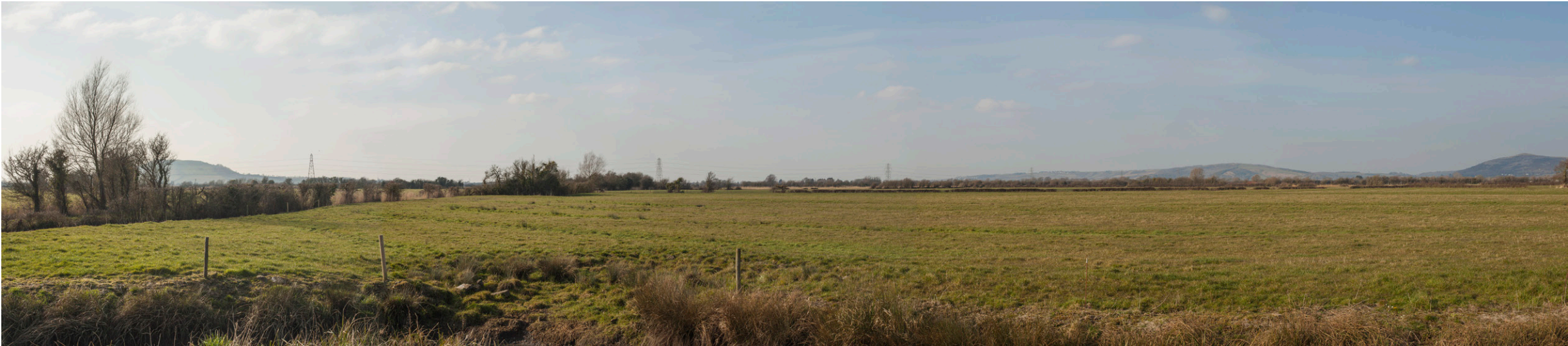
Photograph B1.76: Existing view from Kingsway looking northwest across fields towards the route of the proposed 400kV overhead line and the F Route with Brent Knoll and the Mendip Hills beyond