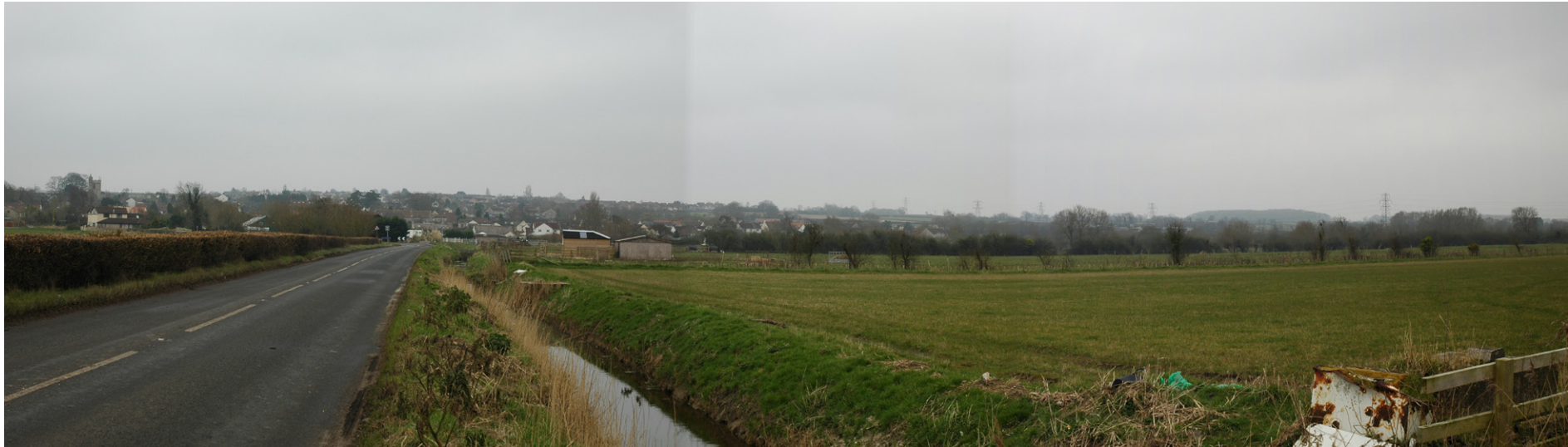
Photograph B1.9: Existing view from a track off the B3139 Causeway looking south across farmland towards Woolavington, the F Route and the route of the proposed 400kV overhead line