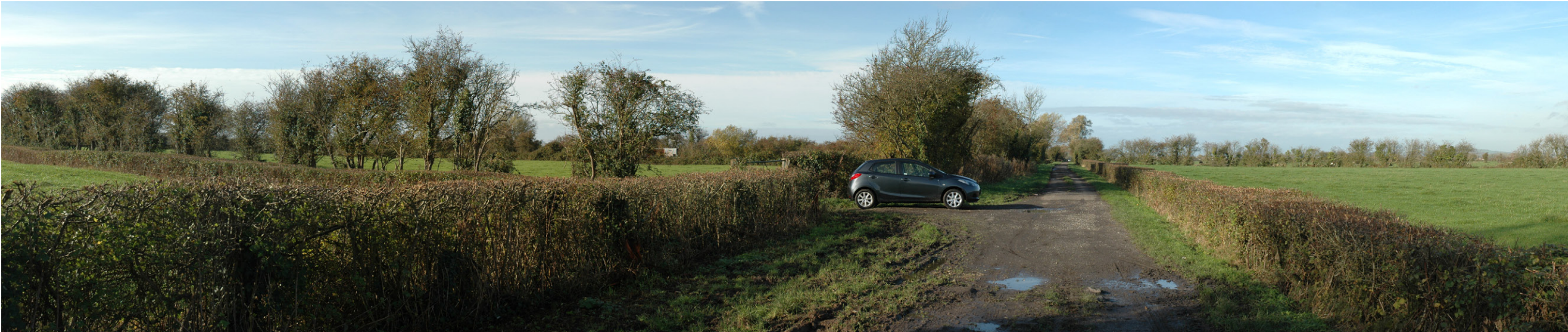
Photograph B1.37: Existing view from the northwestern end of PRow AX23/9 looking west and north towards the route of the proposed 400kV overhead line screened by intervening field boundary hedgerow and trees