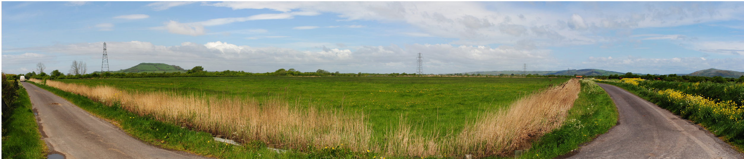
Photograph B1.75: Existing view from Pill Road at the northern end of PRow AX 17/30, looking southwest to northeast across fields towards the route of the proposed 400kV overhead line and the F Route