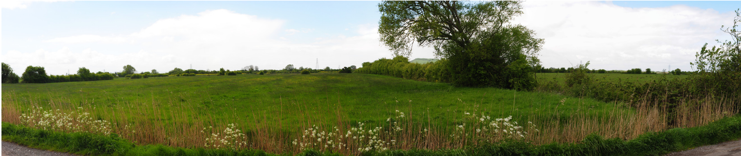
Photograph B1.73: Existing view from Kingsway near the route of PRow AX 2/14 and south of New Homestead Farm looking southwest to northwest across fields towards the route of the proposed 400kV overhead line and towards the F Route beyond