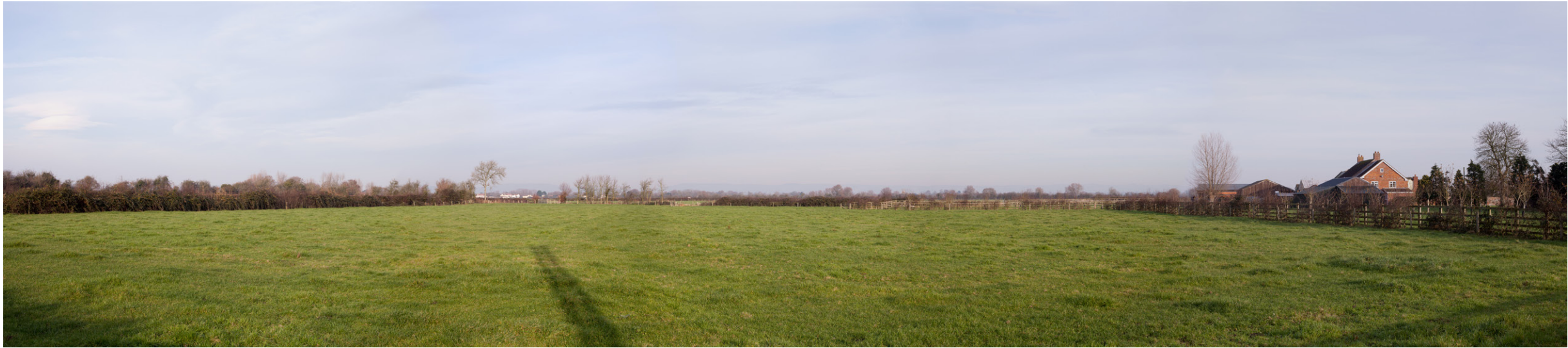
Photograph B1.34: Existing view from Southwick Road north of the entrance to Southwick Farm looking northeast towards the route of the proposed 400kV overhead line across farmland