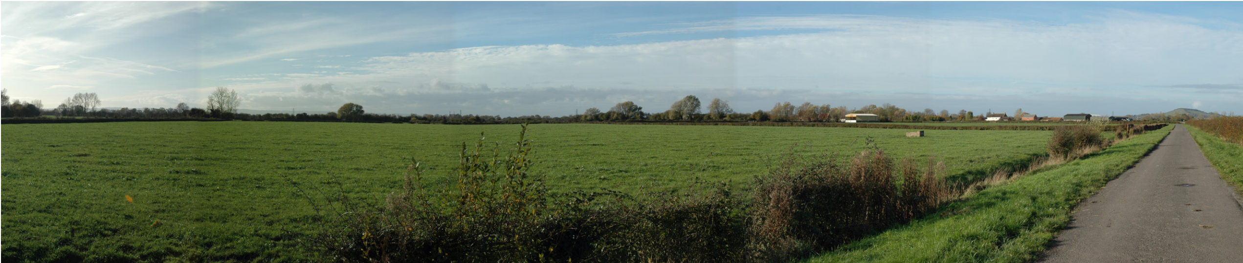
Photograph B1.36: Existing view from an unnamed track running southwest from Southwick Road looking southwest to northeast across farmland towards the route of the proposed 400kV overhead line and the F Route above field boundary hedgerow and trees