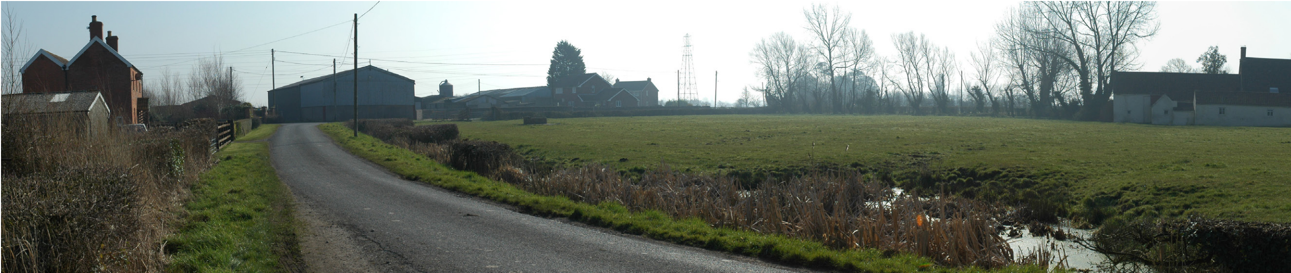
Photograph B1.67: Existing view from Vole Road near Vole Farm looking east to southwest towards the F Route and the route of the proposed 400kV overhead line above and beyond properties at Vole