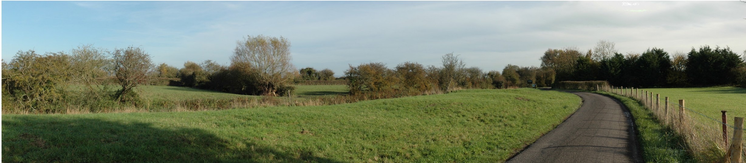
Photograph B1.31: Existing view from Merry Lane leading to Cripps Farm looking northeast and southeast towards the route of the proposed 400kV overhead line above intervening field hedgerow and trees