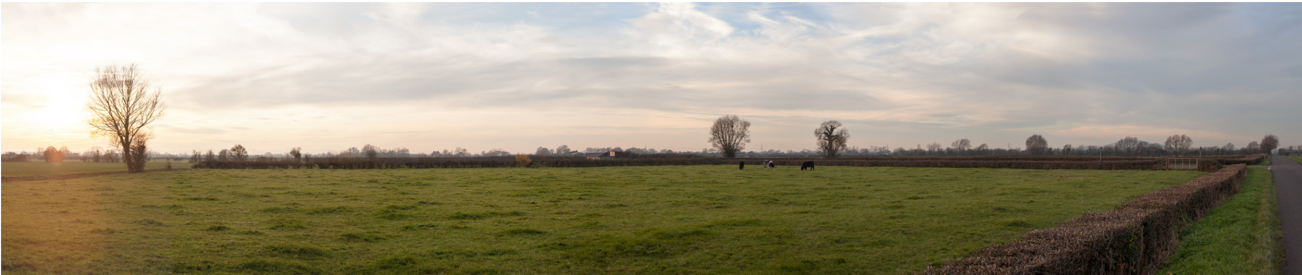
Photograph B1.38: Existing view from Tile House Road looking west and northwest towards the route of the proposed 400kV overhead line across flat farmland