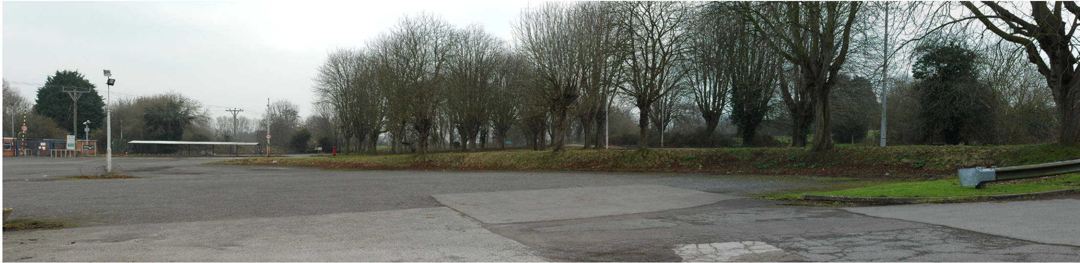
Photograph B1.2 (Part 1): Existing view from Club 37 on the Western Approach Road within the former Ordnance Factory site (between Puriton and Woolavington) looking south and east towards the F Route and the route of the proposed 400kV overhead line heavily filtered by intervening trees