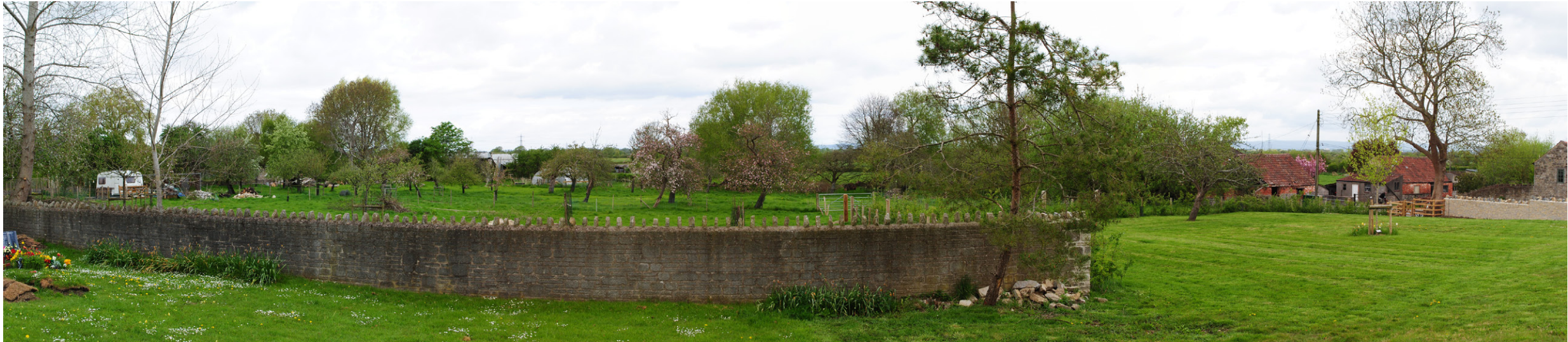
Photograph B1.10: Existing view from PRow BW 37/8, north of properties on Church Street, Woolavington, looking northwest, north and northeast towards the F Route and the route of the proposed 400kV overhead line partly visible above and between intervening trees