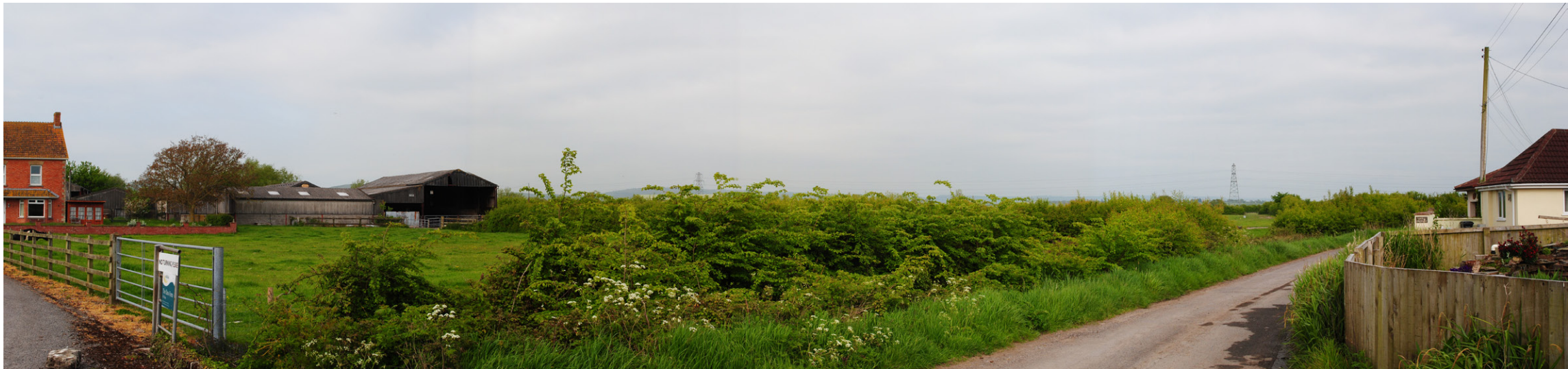
Photograph B1.80: Existing view from Gills Lane near the entrance to The Elms Farm looking eastwards across farmland towards the F Route and the route of the proposed 400kV overhead line above intervening field boundary hedgerow and trees