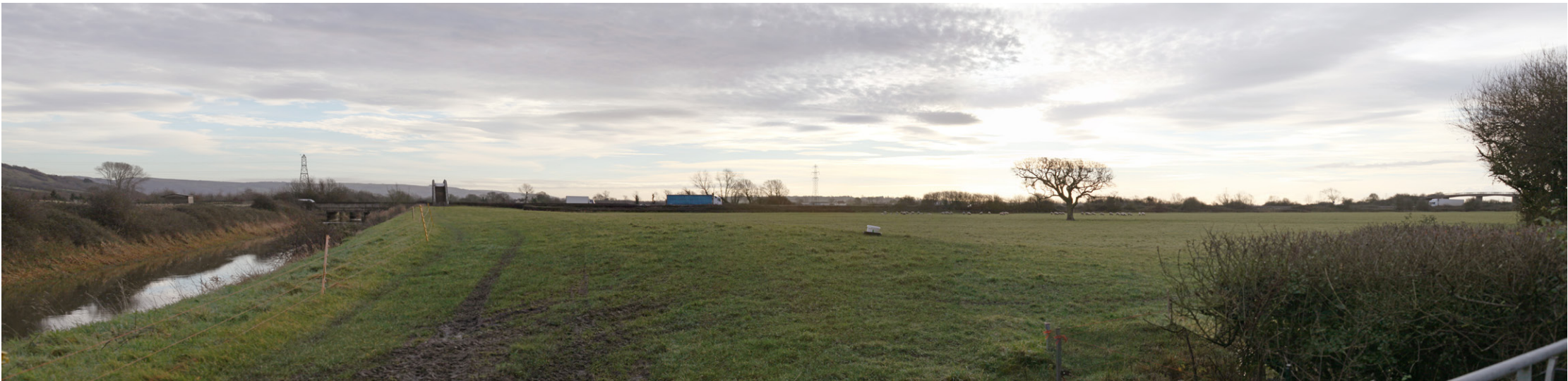
Photograph B1.111: Existing view from PRow AX 21/3 adjacent to the River Axe looking east and south towards the F Route beyond the M5 motorway and towards the road bridge and embankment trees and shrubs screening the proposed CSE compound