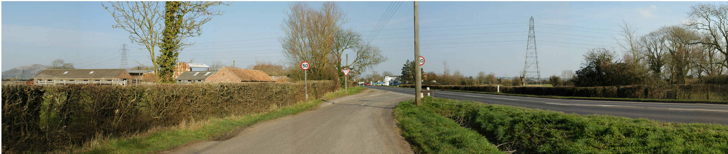
Photograph B1.86: Existing view from the junction between Chapel Road and the A38 Bristol Road looking northeast to southwest across the A38 towards the F Route and the route of the proposed 400kV overhead line