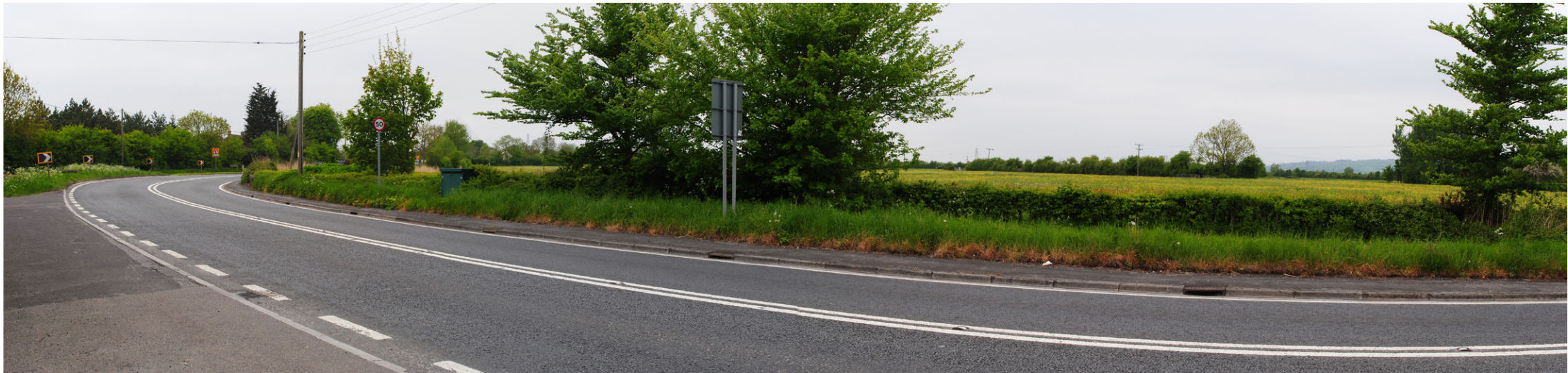
Photograph B1.92: Existing view from the A38 Bristol Road near a residential property at Biddisham Bridge looking southwest to northeast towards the F Route and the route of the proposed 400kV overhead line in the distance beyond farmland and between intervening roadside and field boundary hedgerow and trees