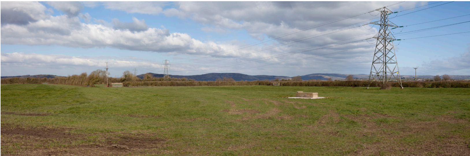
Photograph B1.65: Existing view from PRow AX 23/14 between Vole and Pillrow Wall looking north along the F Route and towards the route of the proposed 400kV overhead line across fields, with the Mendip Hills beyond