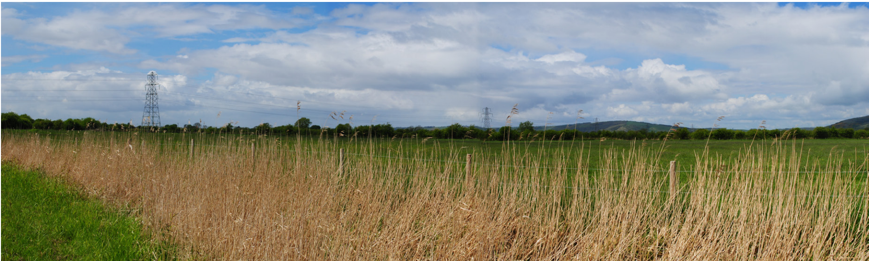
Photograph B1.77 (Part 2): Existing view from PRow AX 17/12 south of Gills Lane looking south across fields towards the F Route and the route of the proposed 400kV overhead line above and between field hedgerow and trees