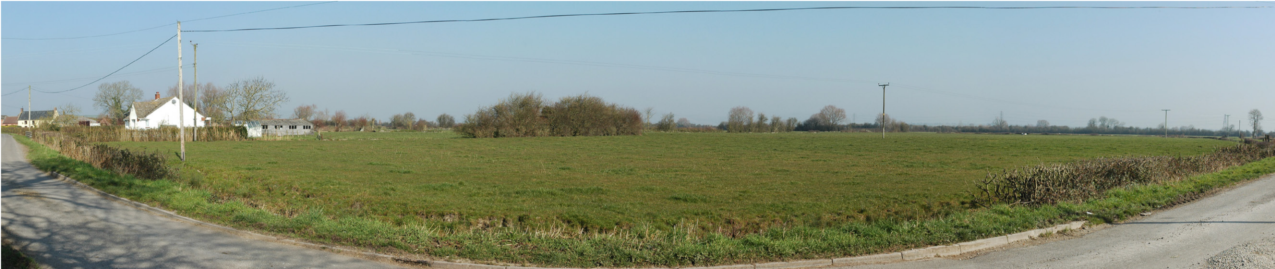
Photograph B1.69: Existing view from Vole Road near the entrance to Chestnut Farm and Knoll View Farm looking north to southeast across fields adjacent Vole and Pill Road towards the F Route and the route of the proposed 400kV overhead line