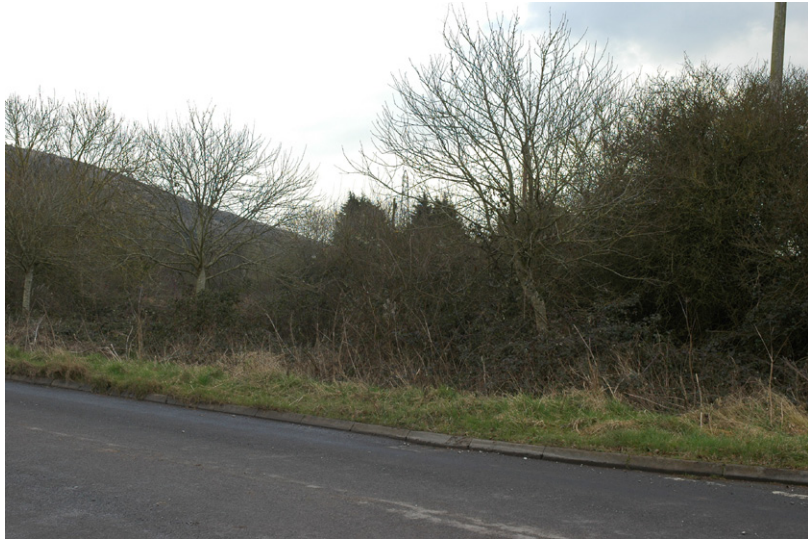
Photograph B1.115: Existing view from Sevier Road opposite the junction with Cowslip Lane looking southeast through a field gate towards the F Route in the distance beyond the M5 motorway