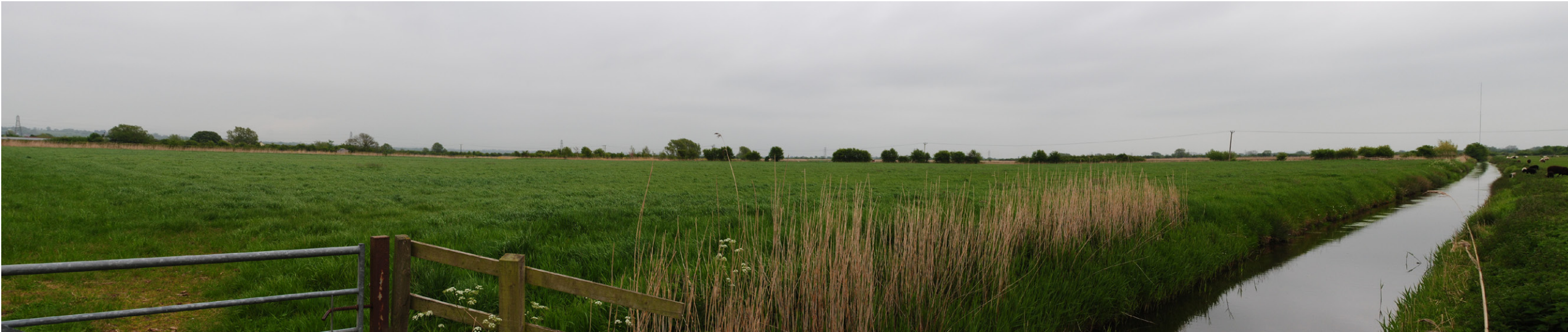
Photograph B1.82: Existing view from Mudgeley Road near The Stables Business Park looking east to southwest across fields towards the F Route and the route of the proposed 400kV overhead line above intervening hedgerow and trees