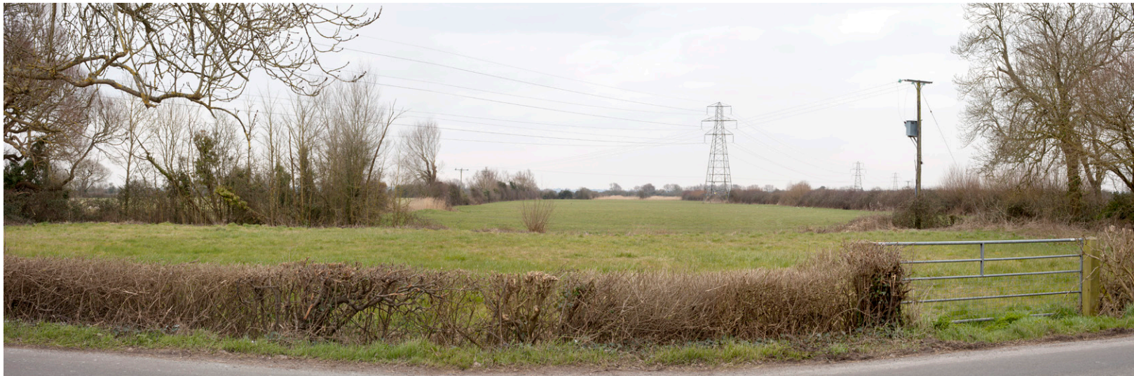
Photograph B1.54: Existing view from near The Old Barn on the B3139 Mark Causeway through Mark looking south across fields along the F Route