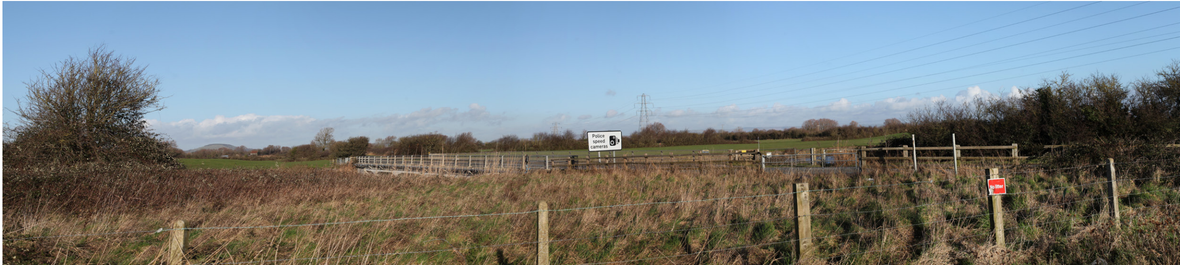
Photograph B1.18d: Existing view from the car park adjacent to the B3139 Causeway and the Huntspill River, looking northeast towards the F Route and the route of the proposed 400kV overhead line