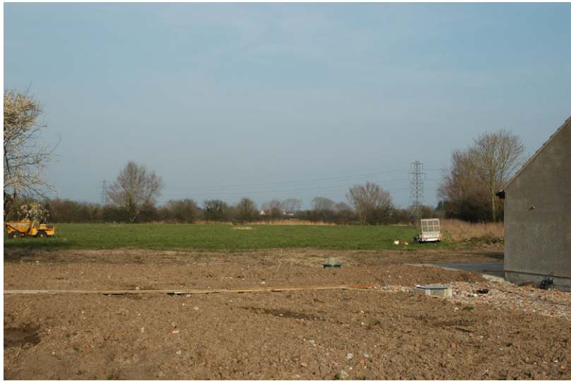
Photograph B1.57: Existing view from adjacent a property on Harp Road looking northeast and east towards the F Route beyond farmland and towards the route of the proposed 400kV overhead line beyond