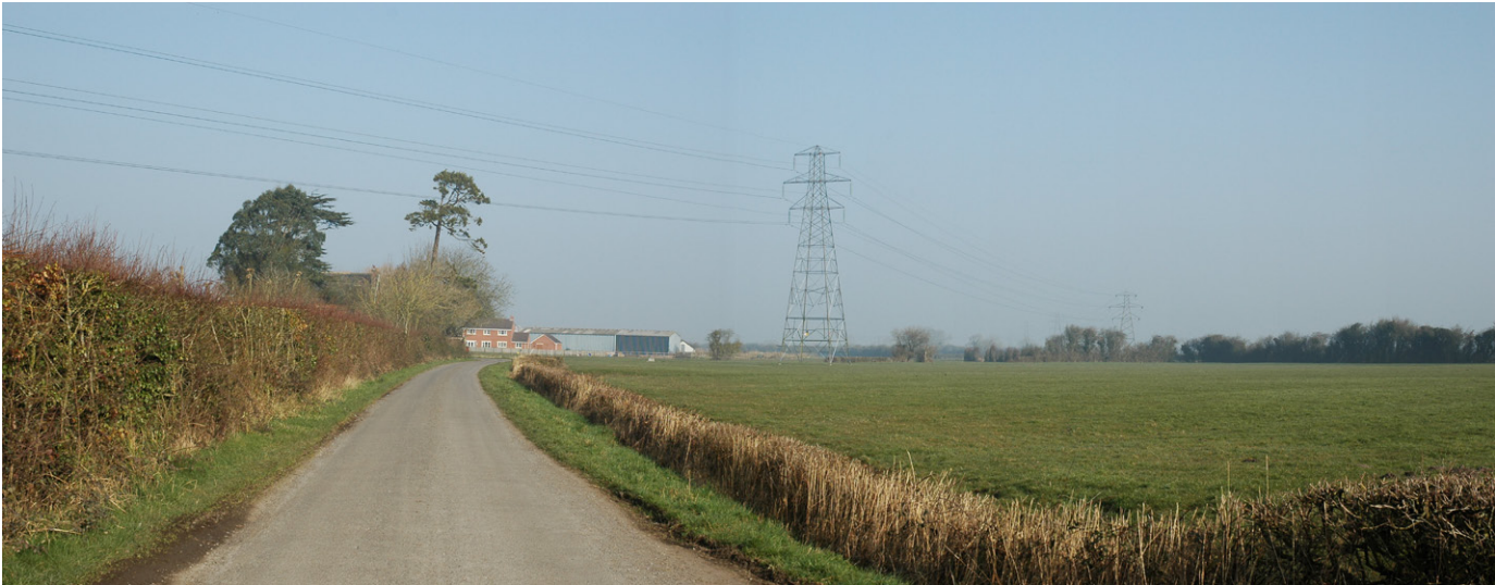
Photograph B1.64: Existing view from Vole Road looking northwest to northeast towards the F Route and the route of the proposed 400kV overhead line