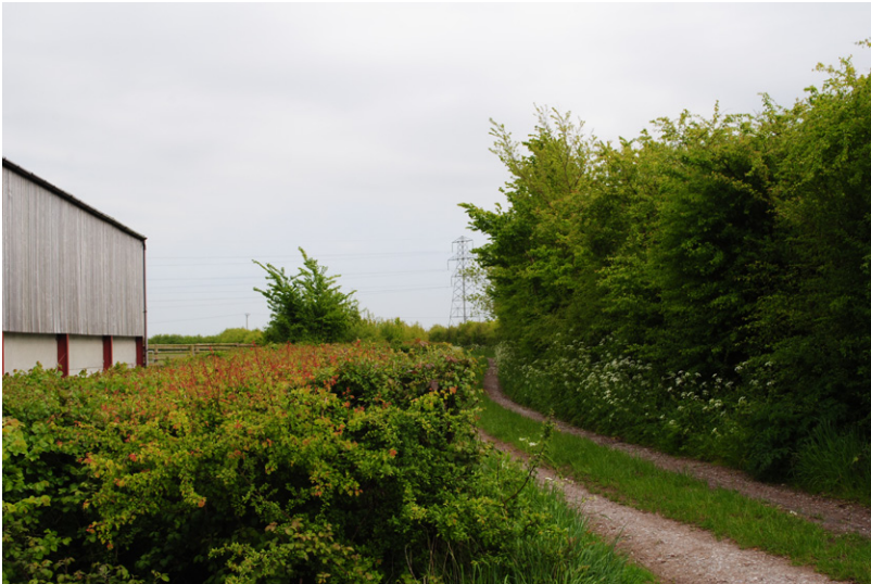
Photograph B1.81: Existing view from Old Mead Lane near an agricultural building looking southeastwards along the track towards the F Route and the route of the proposed 400kV overhead line above field boundary hedgerow and trees