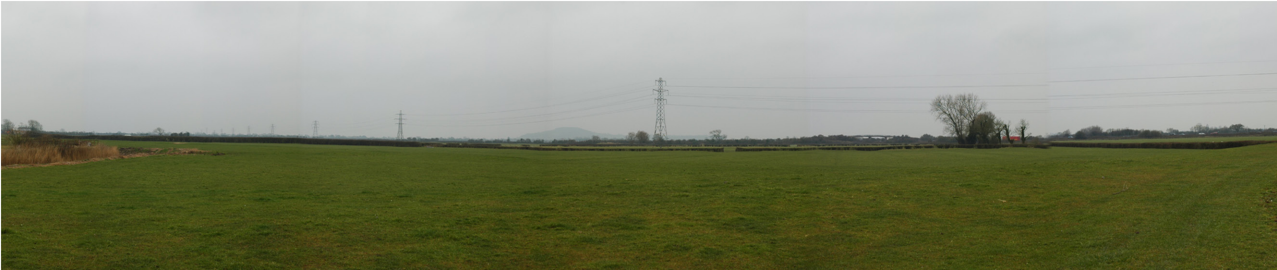
Photograph B1.105: Existing view from PRow AX 21/3 parallel to the River Axe looking southeast to northwest towards the F Route, the route of the proposed 400kV underground cables and overhead line and towards the site of the proposed CSE compound near the M5 motorway. Existing views extend across open farmland with some filtering and screening by field boundary hedgerow and trees