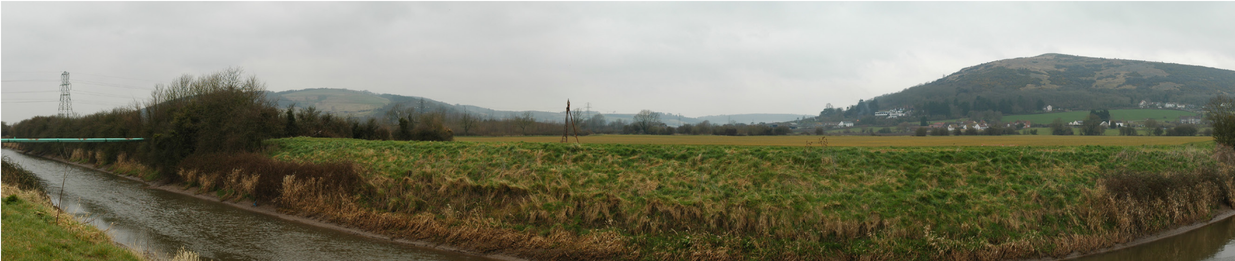
Photograph B1.106: Existing view from PRow AX 21/3 parallel to the River Axe looking west to east along the River Axe and across farmland towards the F Route, and the route of the proposed 400kV underground cables. Existing views extend across open farmland with views northwest shortened by mature shrubs and trees north of the River Axe