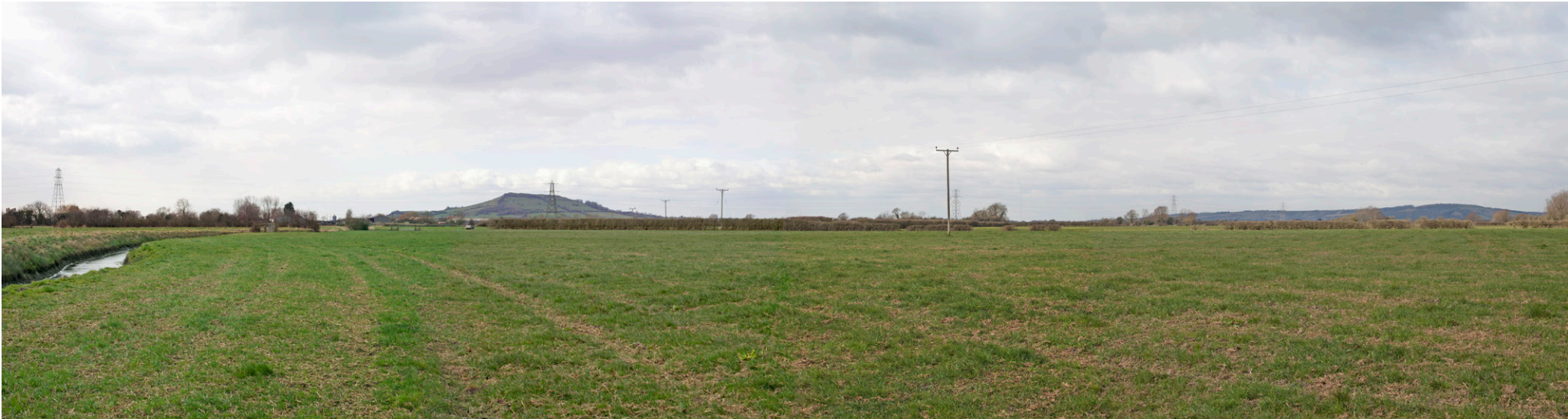
Photograph B1.71: Existing view from PRow AX 23/14 east of Vole looking northwest towards the F Route and the route of the proposed 400kV overhead line, with Brent Knoll and the Mendip Hills beyond