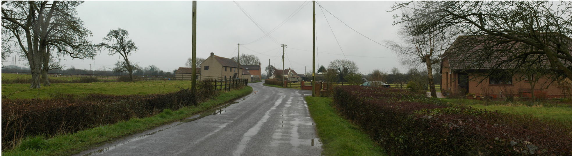
Photograph B1.100 (Part 2): Existing view from Rooksbridge Road near Nut Tree Farm looking northeast to south towards the F Route and the route of the proposed 400kV overhead line between intervening trees and hedgerow