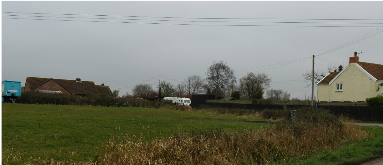
Photograph B1.24 (Part 2): Existing view from Burtle Road, near a road junction at Cote, looking northwest, north and northeast towards the F Route and properties at Cote