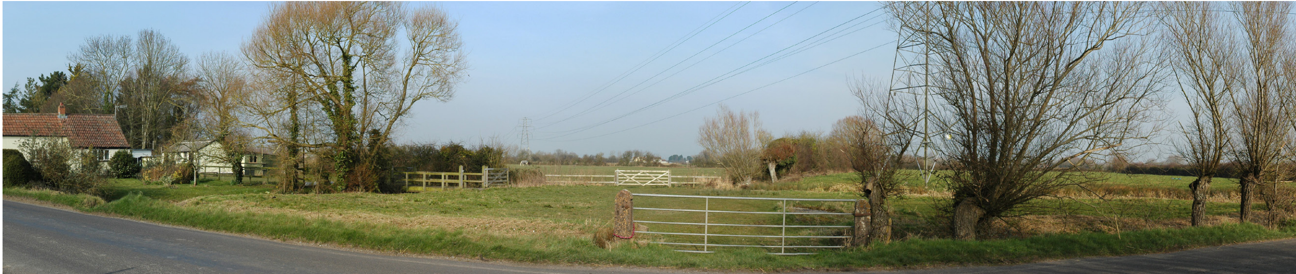
Photograph B1.53: Existing view from Harp Road looking northeast towards the F Route north of Back Lane and towards the route of the proposed 400kV overhead line further east