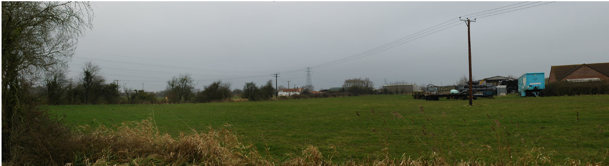
Photograph B1.24 (Part 1): Existing view from Burtle Road, near a road junction at Cote, looking northwest, north and northeast towards the F Route and properties at Cote