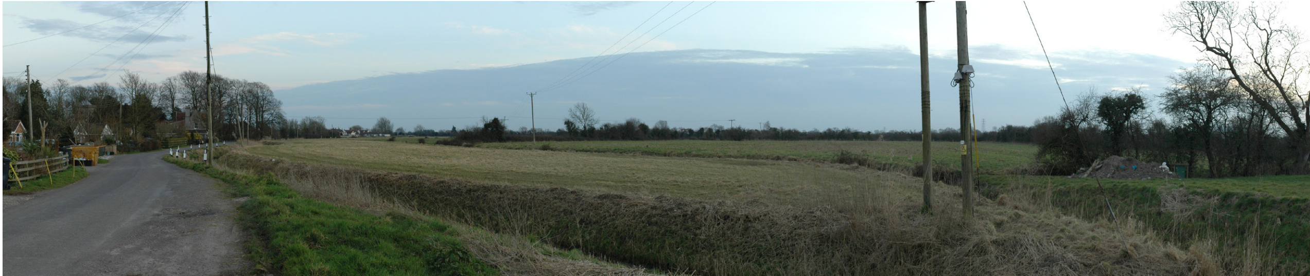
Photograph B1.99 (Part 1): Existing view from Biddisham Lane near properties south of Coombe’s Way looking southeast to northwest across farmland towards the F Route and the route of the proposed 400kV overhead line above and between intervening field boundary hedgerow and trees