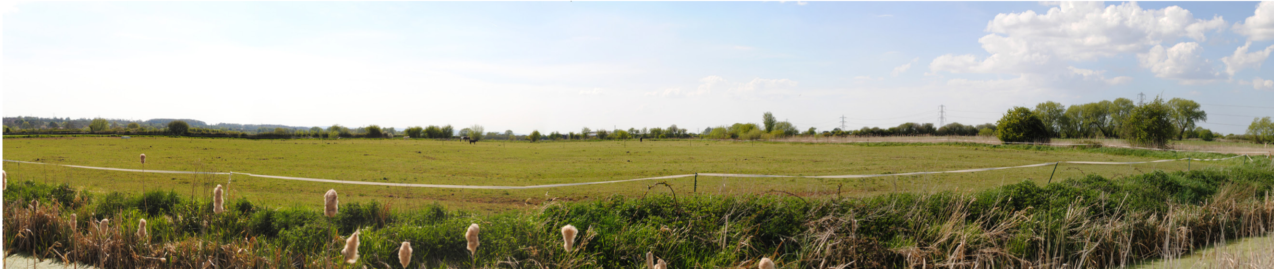
Photograph B1.12: Existing view from PRow BW 37/11 looking westwards towards the F Route and the route of the proposed 400kV overhead line beyond farmland across Woolavington Level