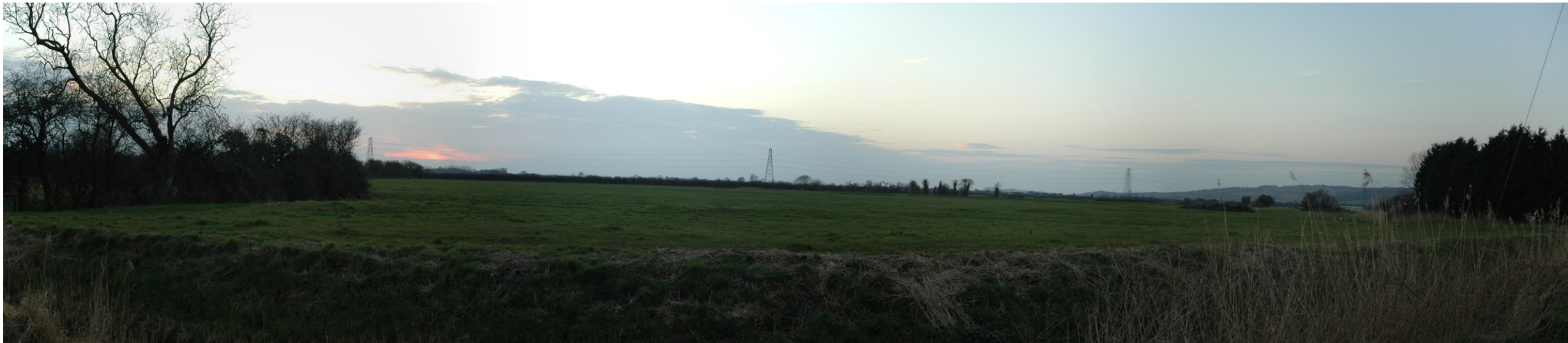
Photograph B1.99 (Part 2): Existing view from Biddisham Lane near properties south of Coombe’s Way looking southeast to northwest across farmland towards the F Route and the route of the proposed 400kV overhead line above and between intervening field boundary hedgerow and trees