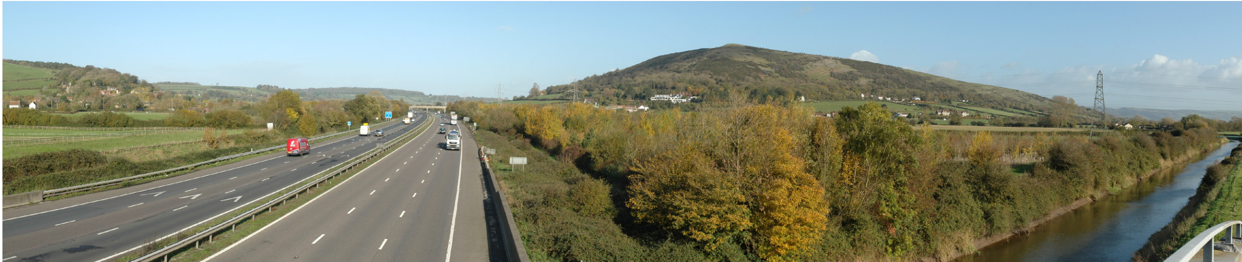
Photograph B1.109: Existing view from PRow AX 21/3 on the footbridge over the M5 motorway looking east to southwest across the M5 motorway and farmland towards the F Route, the route of the proposed 400kV underground cables and 400kV overhead line and towards the site of the proposed CSE compound screened by the road bridge embankment including mature trees and shrubs