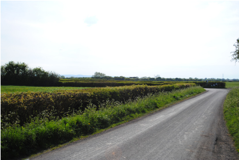
Photograph B1.23: Existing view from Long Moor Drove looking west along this road towards the route of the proposed 400kV overhead line and the F Route above and between intervening hedgerow and trees