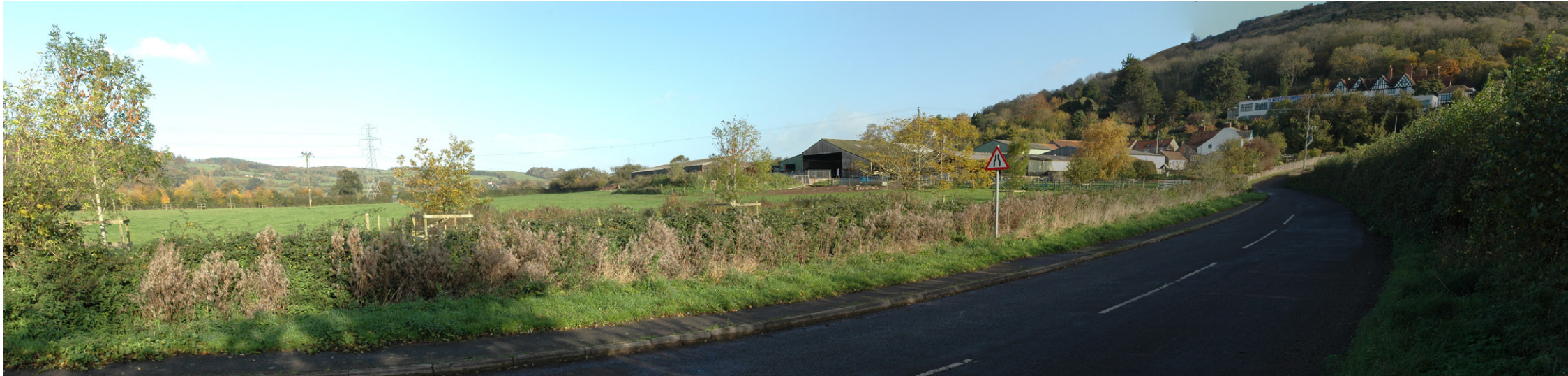
Photograph B1.114: Existing view from Webbington Road and the West Mendip Way long distance footpath looking north and northeast towards the route of the proposed 400kV underground cables and towards the F Route