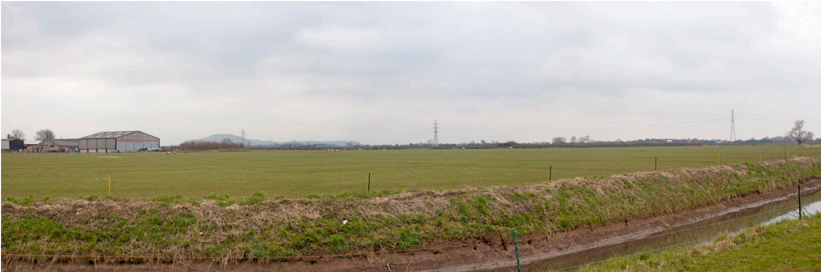
Photograph B1.103: Existing view from Biddisham Lane north of Biddisham looking southwest across flat farmland towards the F Route and the route of the proposed 400kV overhead line and the site of the proposed CSE compound beyond