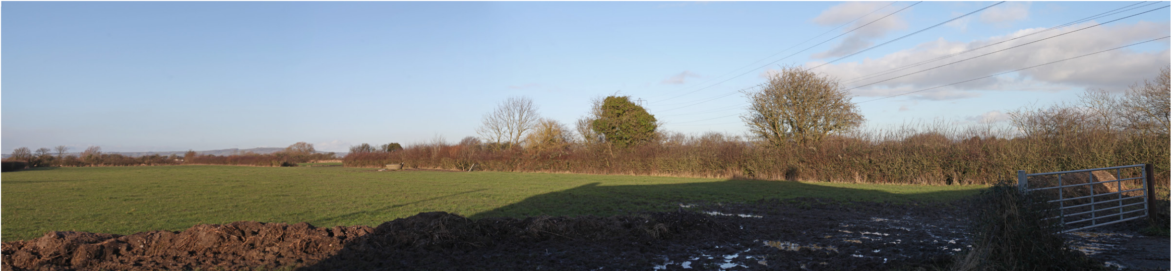
Photograph B1.59b: Existing view from Northwick Road looking northeast towards the F Route beyond a hedgerow and trees and towards the route of the proposed 400kV overhead line beyond