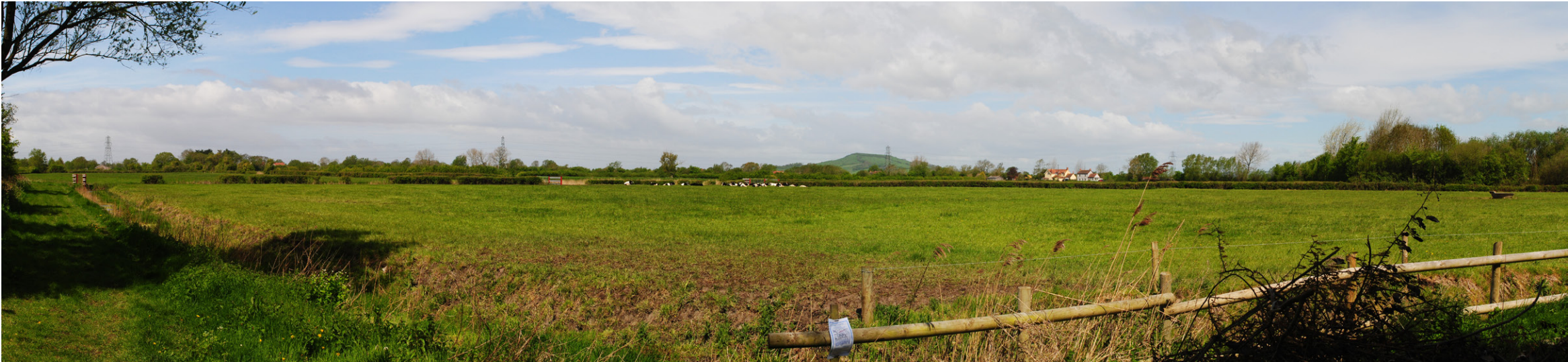
Photograph B1.50: Existing view from PRow AX23/10 looking west to northeast across farmland towards the route of the proposed 400kV overhead line and the F Route beyond and above intervening hedgerow and trees