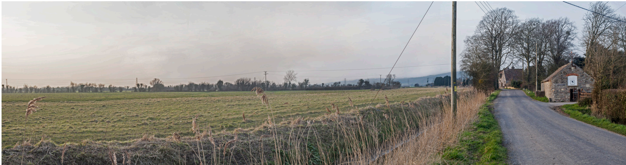
Photograph B1.97: Existing view from Biddisham Lane adjacent to PRow AX 2/9 looking northwest towards Manor Farm and The Old School adjacent to Biddisham Lane, and across fields towards the F Route and the route of the proposed 400kV overhead line above trees, and towards the site of the proposed CSE compound with the Mendip Hills beyond