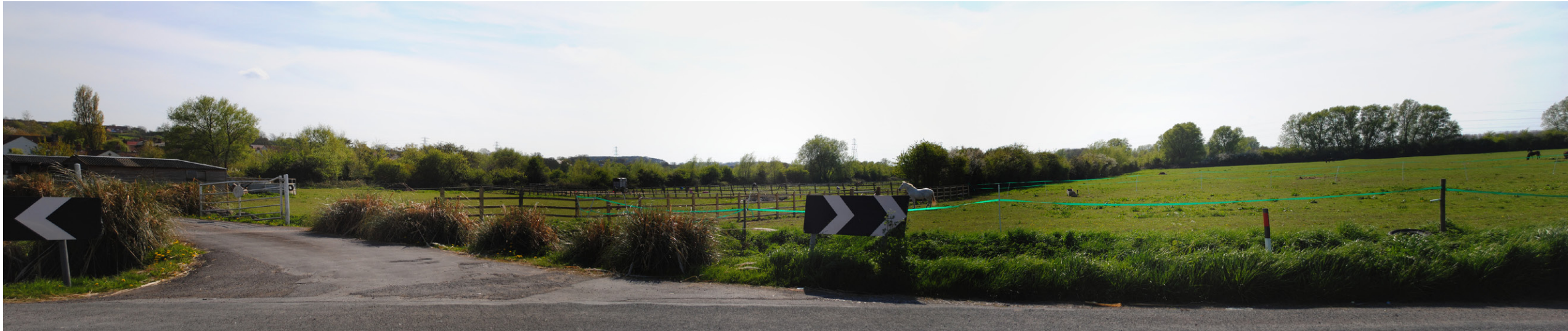
Photograph B1.8 (Part 1): Existing view from the B3139 Causeway, north of Pear Tree Farm, Woolavington, looking southwest, west and north across farmland on Woolavington Level towards the F Route and the route of the proposed 400kV overhead line