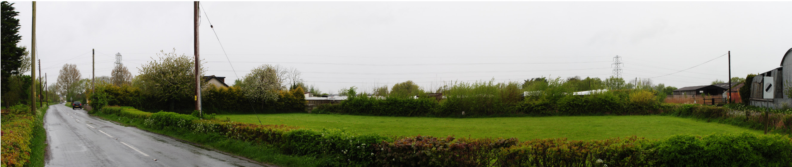
Photograph B1.51: Existing view from Mark Causeway looking west and north towards the F Route passing over Coombes Cider Farm Caravan Park