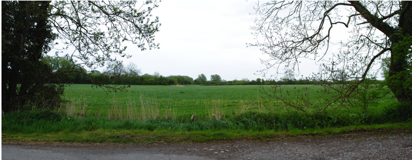
Photograph B1.19: Existing view from Cornmoor Lane near the entrance to Cornmoor Farm Wall looking eastwards across farmland on Huntspill Moor towards the F Route and the route of the proposed 400kV overhead line, above intervening field boundary hedgerow and trees