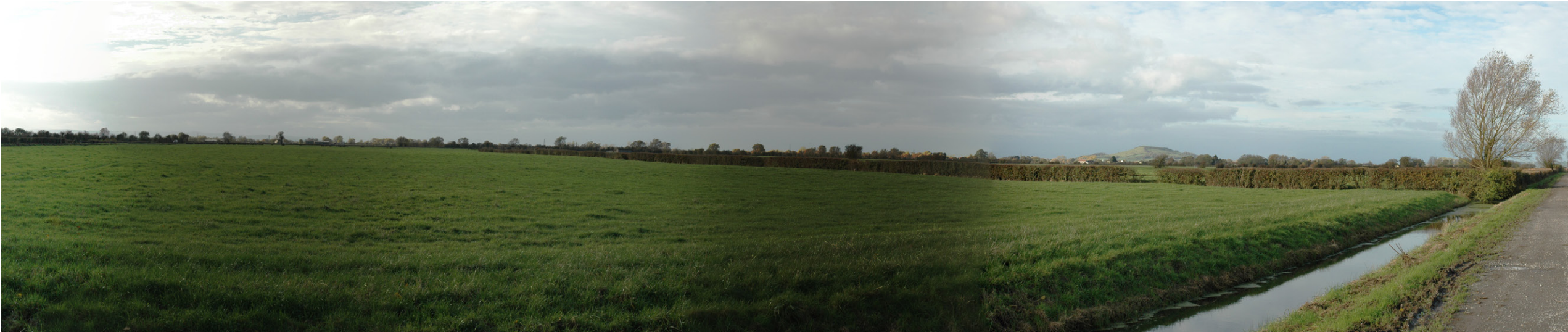
Photograph B1.39b: Existing view from PRow AX 23/5 on Green Drove looking southwest to north across flat farmland towards the route of the proposed 400kV overhead line and the F Route beyond above intervening hedgerow and trees