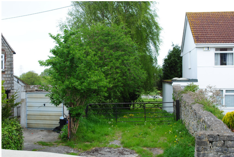
Photograph B1.5: Existing view from Lower Road, Woolavington looking north between residential properties towards the F Route and the route of the proposed 400kV overhead line running across Woolavington Level