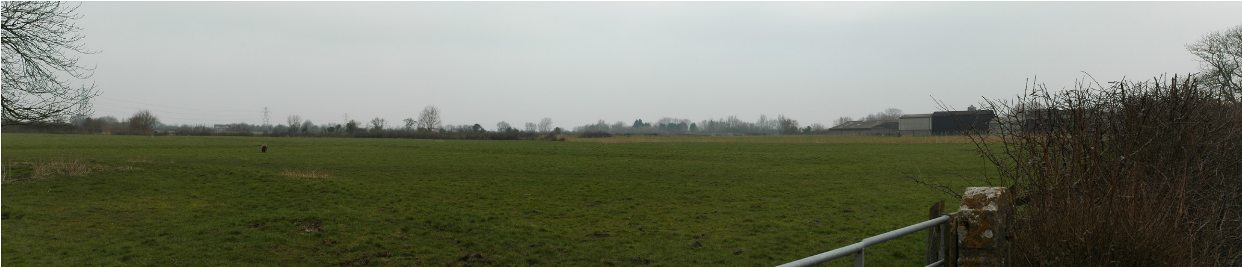
Photograph B1.47: Existing view from Mark Causeway looking north and east towards the route of the proposed 400kV overhead line passing over fields north of Mark Causeway