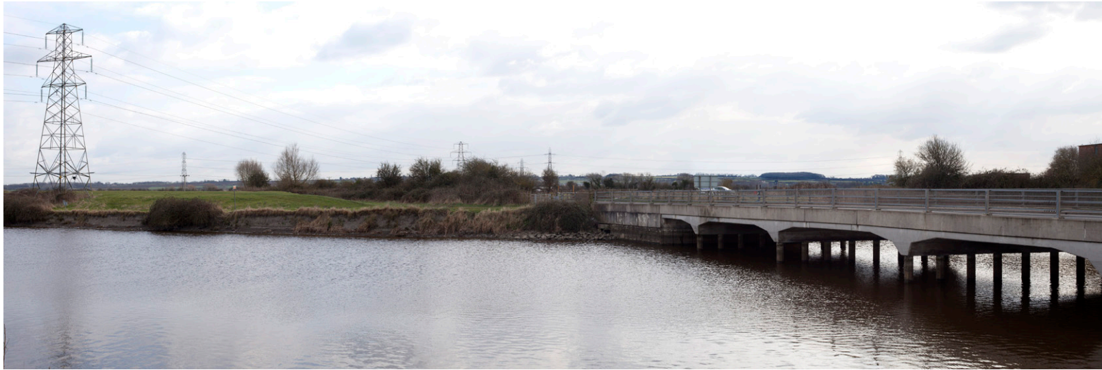
Photograph B1.18b: Existing view from the anglers permissive footpath adjacent to the Huntspill River near to the B3139 Causeway, looking south across the river towards the F Route and the route of the proposed 400kV overhead line, with the ZG Route beyond and Puriton Ridge in the distance