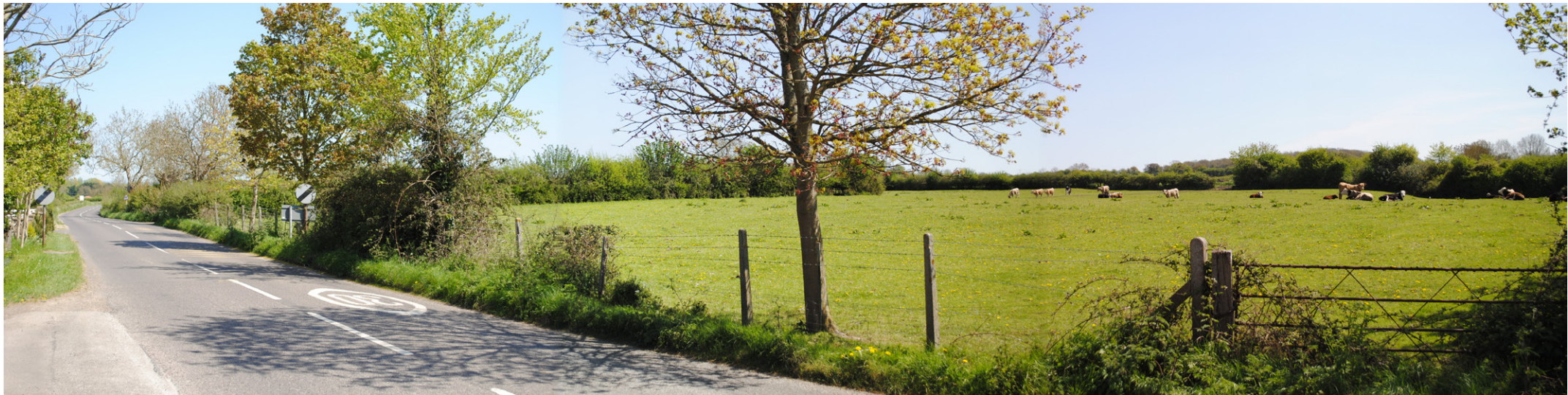
Photograph B1.3: Existing view from Woolavington Road adjacent properties on the eastern edge of Puriton looking south and east towards the route of the proposed 400kV overhead line beyond farmland on the lower slopes of Puriton Ridge