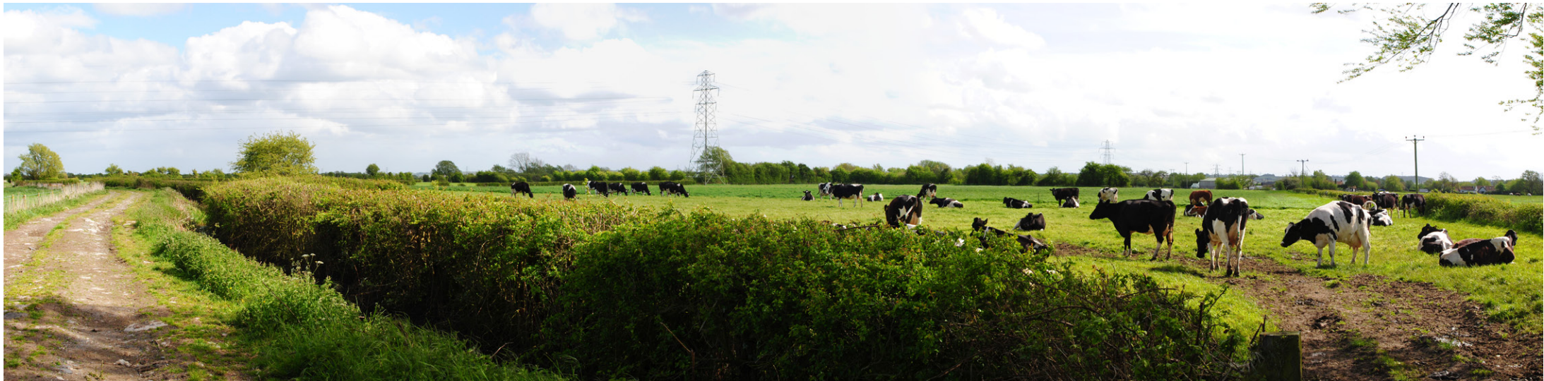
Photograph B1.27: Existing view from PRow BW13/28 looking southeast and south towards the F Route beyond farmland, above intervening hedgerows and trees