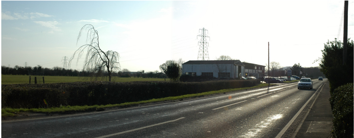
Photograph B1.88: Existing view from the A38 Bristol Road looking west and south towards the F Route and the route of the proposed 400kV overhead line