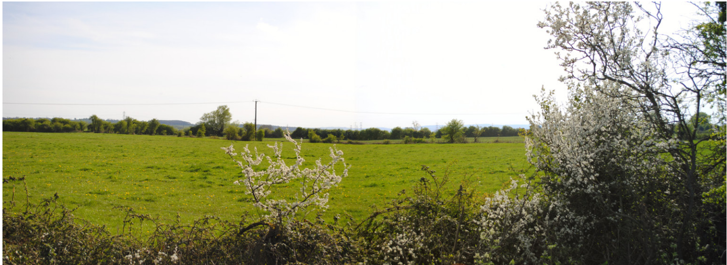
Photograph B1.20: Existing view from Burtle Road and National Cycle Route 33 looking southwest across farmland north of the Huntspill River, towards the route of the proposed 400kV overhead line and the F Route, above and between intervening field boundary hedgerow and trees