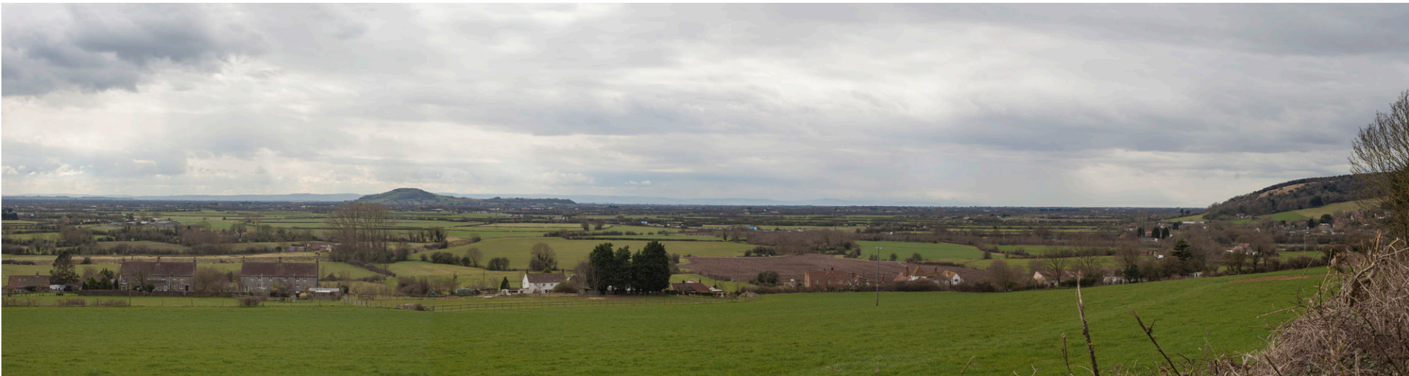
Photograph B1.113: Existing view from Webbington Road near PRow AX 15/2 looking southwest across the Somerset Levels towards Brent Knoll and Loxton Gap, towards the route of the proposed 400kV underground cables and the F Route beyond, and towards the site of the proposed CSE compound and the route of the proposed 400kV overhead line further to the southwest