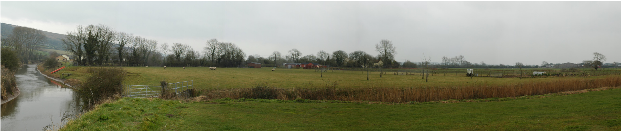
Photograph B1.107: Existing view from PRow AX 21/3 looking east to southeast across farmland towards properties on Biddisham Lane