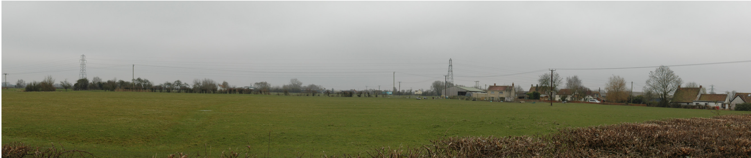
Photograph B1.25: Existing view from Whitehouse Lane looking northeast, east and south towards the F Route running across Huntspill Moor and between properties at Cote