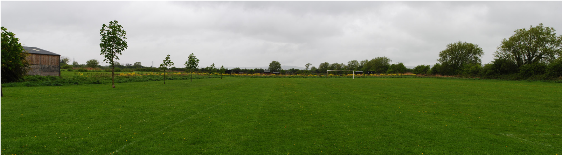
Photograph B1.63: Existing view from Mark Moor Sports Pitches on Vole Road looking northwest to northeast across a sports pitch towards the route of the proposed 400kV overhead line and towards the F Route