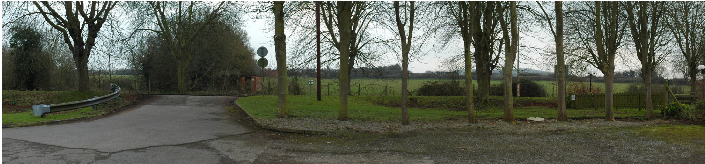
Photograph B1.2 (Part 2): Existing view from Club 37 on the Western Approach Road within the former Ordnance Factory site (between Puriton and Woolavington) looking south and east towards the F Route and the route of the proposed 400kV overhead line heavily filtered by intervening trees