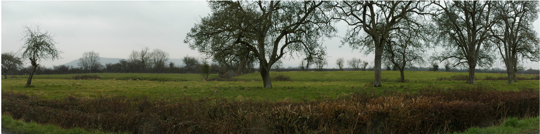
Photograph B1.100 (Part 1): Existing view from Rooksbridge Road near Nut Tree Farm looking northeast to south towards the F Route and the route of the proposed 400kV overhead line between intervening trees and hedgerow