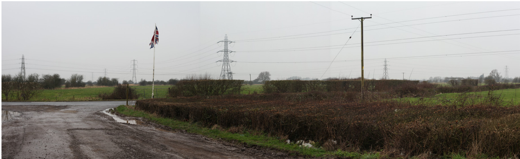
Photograph B1.14: Existing view from PRow BW 37/12 on Middle Moor Drove at the junction with the B3139 Causeway, looking west and northwest across Woolavington Level towards the ZG Route and the F Route and towards the proposed connection between the ZG Route and the proposed 400kV overhead line