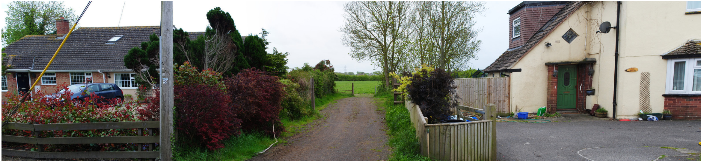
Photograph B1.56: Existing view from the B3139 Mark Causeway looking south between properties on the south side of Mark Causeway towards the F Route beyond farmland and above intervening hedgerow and trees