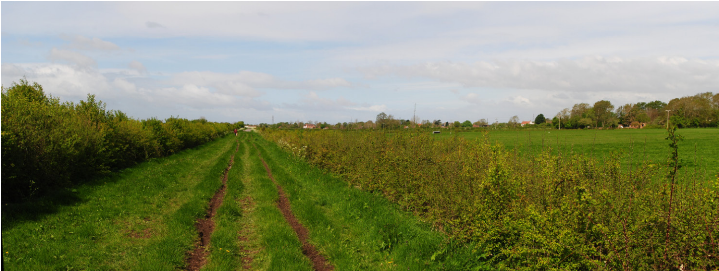
Photograph B1.44: Existing view from PRow AX 23/5 looking westwards along this footpath towards the route of the proposed 400kV overhead line running across and north of Butt Lake Road