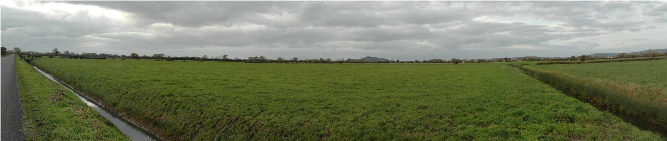
Photograph B1.39a: Existing view from Southwick Road looking southwest to north across flat farmland towards the route of the proposed 400kV overhead line and the F Route beyond above intervening hedgerow and trees