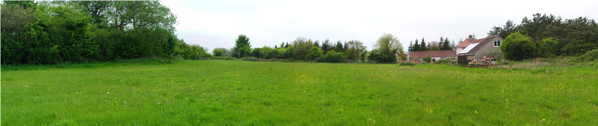
Photograph B1.93: Existing view from PRow AX 2/10 looking east towards the F Route and the route of the proposed 400kV overhead line screened by intervening field boundary hedgerow and trees