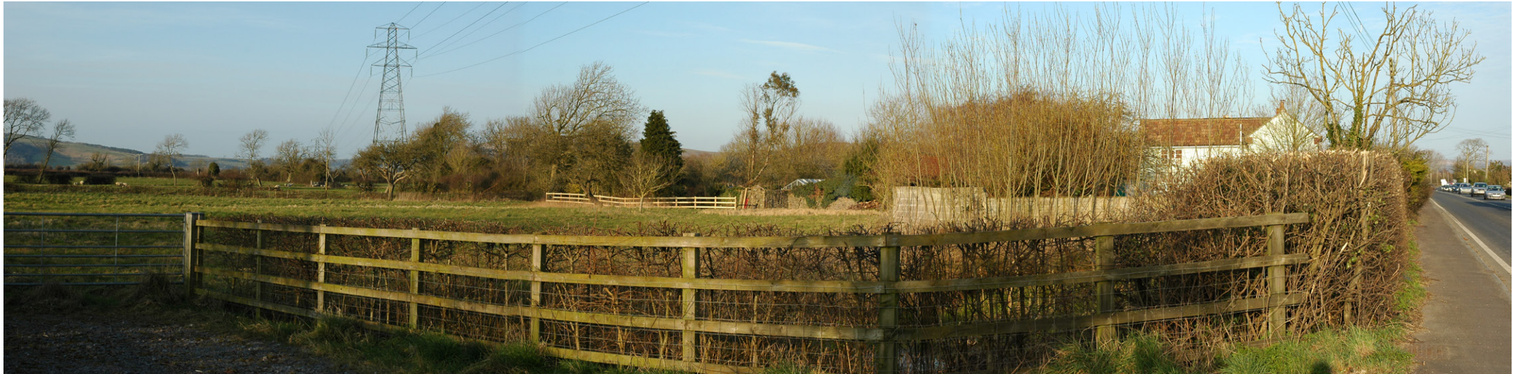
Photograph B1.87: Existing view from the A38 Bristol Road looking north and east towards the F Route and the route of the proposed 400kV overhead line north of Tarnock