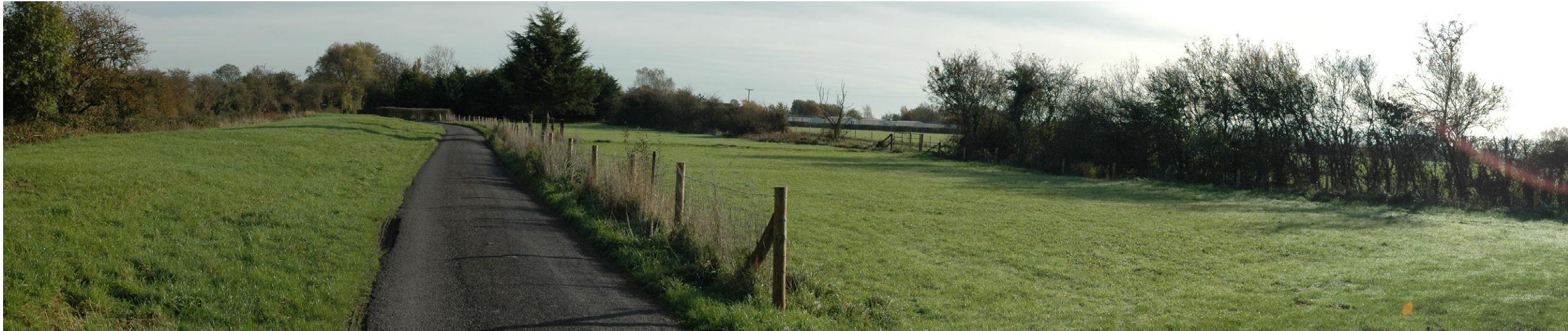
Photograph B1.30: Existing view from Merry Lane leading to Cripps Farm looking southeast and south towards the route of the proposed 400kV overhead line to the north and south of Merry Lane. The view includes caravans visible on the western edge of Cripps Farm Caravan Park through a gap in intervening hedgerow