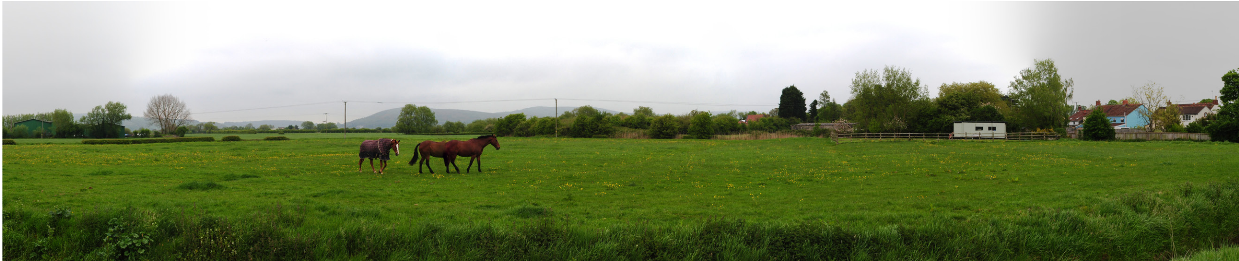
Photograph B1.84: Existing view from the Mendip Road (near farm buildings on the west side of Mendip Road) looking north to southeast towards the F Route and the route of the proposed 400kV overhead line in the distance beyond fields and intervening hedgerow and trees