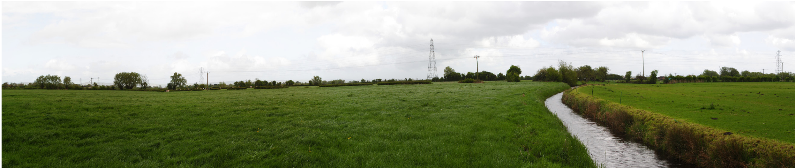
Photograph B1.26: Existing view from PRow BW13/22 looking northeast, east and south towards the F Route running across Huntspill Moor