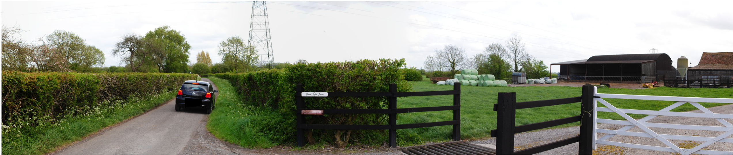
Photograph B1.29: Existing view from Merry Lane adjacent Moor Row, looking northeast, east and southeast towards the F Route in the vicinity of Moor Row