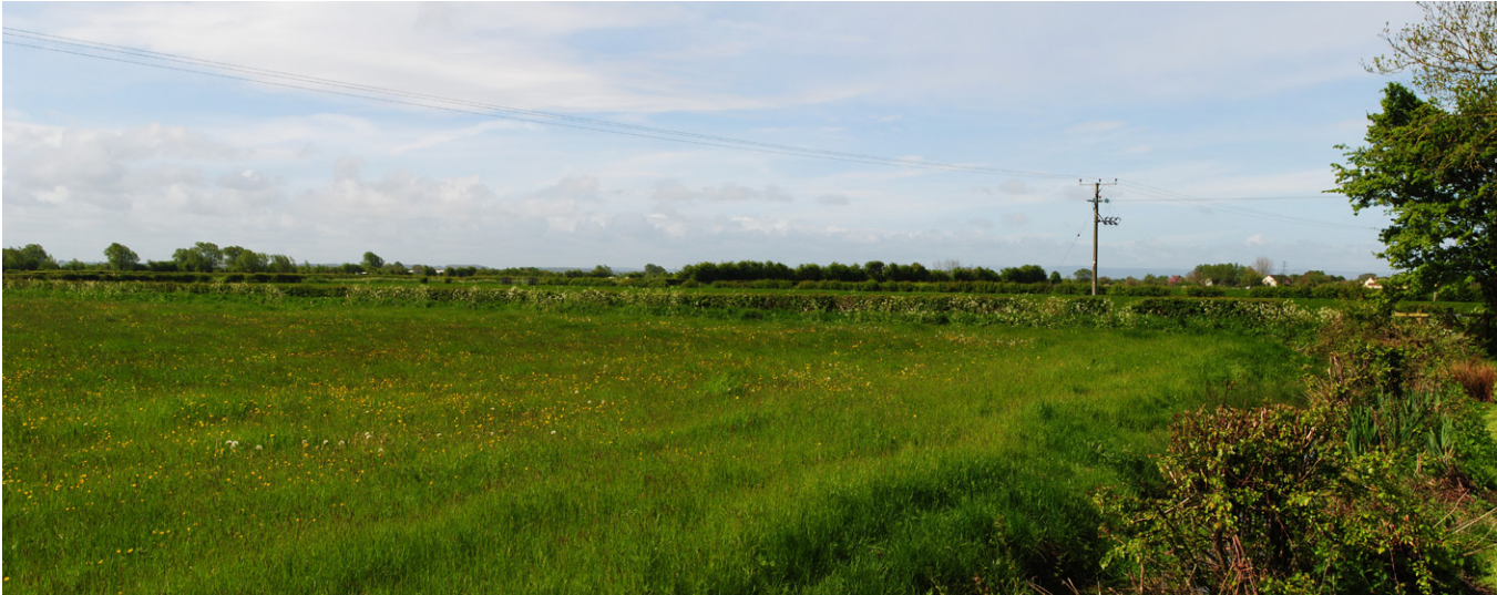
Photograph B1.43: Existing view from PRow AX 23/6 looking west and southwest across farmland towards the route of the proposed 400kV overhead line running across Butt Lake Road