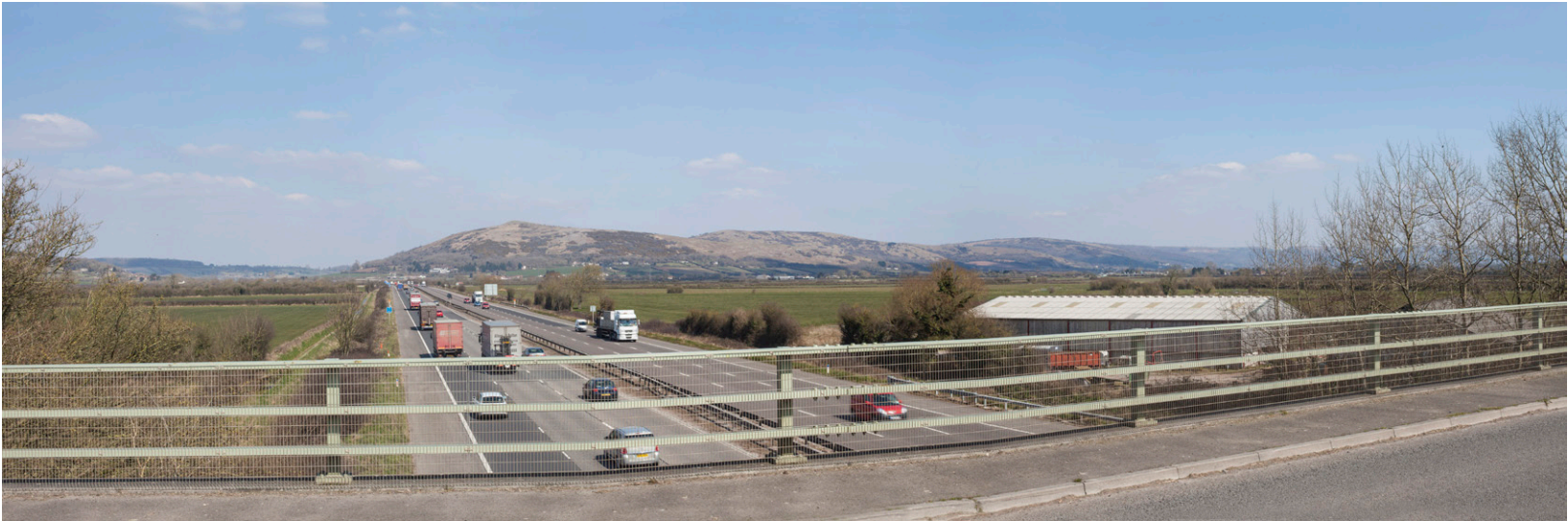
Photograph B1.102: Existing view from Mendip Road on the bridge over the M5 motorway looking northeast along the motorway towards the site of the proposed CSE compound and the route of the proposed 400kV overhead line across fields and towards the F Route beyond, backgrounded by the Mendip Hills