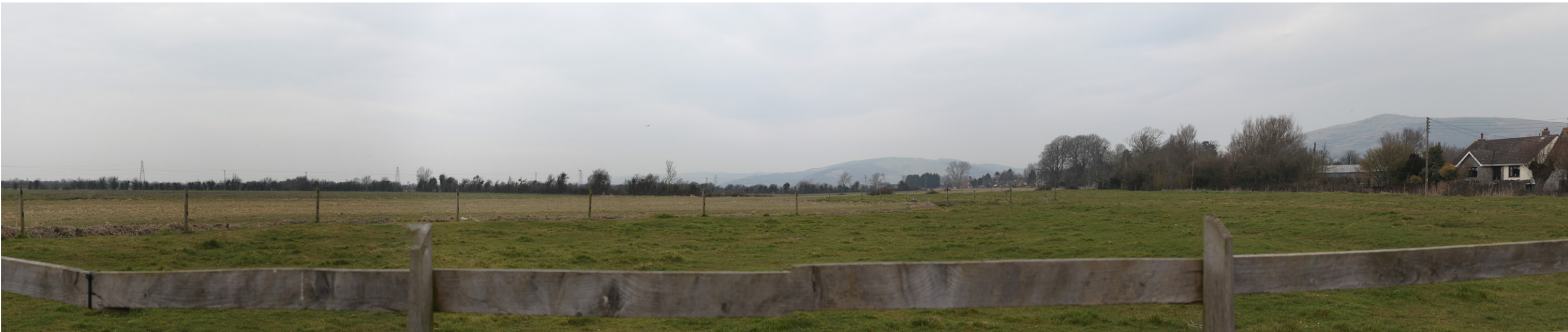
Photograph B1.95: Existing view from an access road west of Biddisham Lane near adjacent properties looking west to northeast across farmland towards the F Route and the route of the proposed 400kV overhead line above and between intervening field boundary hedgerow and trees