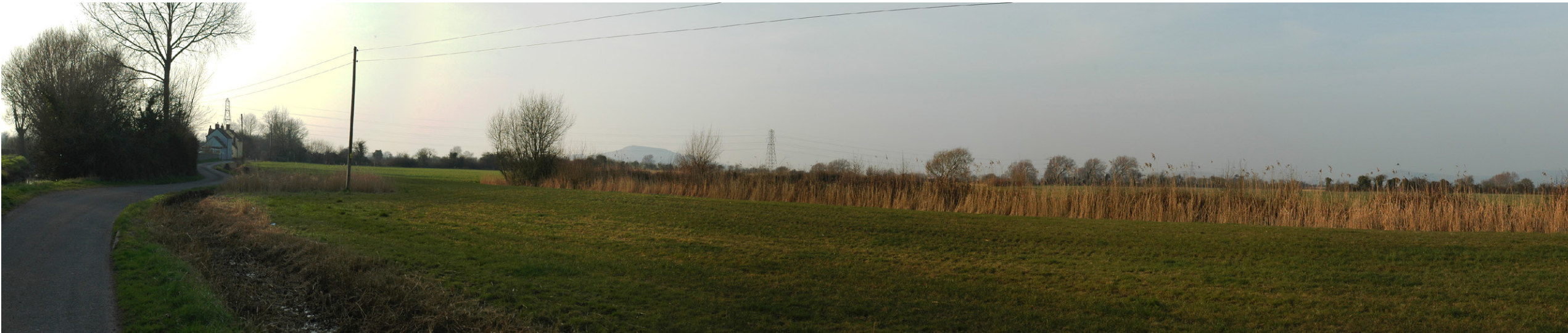
Photograph B1.60: Existing view from the eastern end of Northwick Road looking northwest to northeast across farmland towards the F Route and the route of the proposed 400kV overhead line