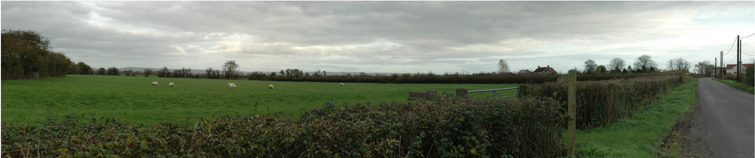
Photograph B1.33: Existing view from Southwick Road looking northeast and southeast along the route of PRow AX23/3 across adjacent fields, and towards the route of the proposed 400kV overhead line across farmland and beyond Southwick Farm