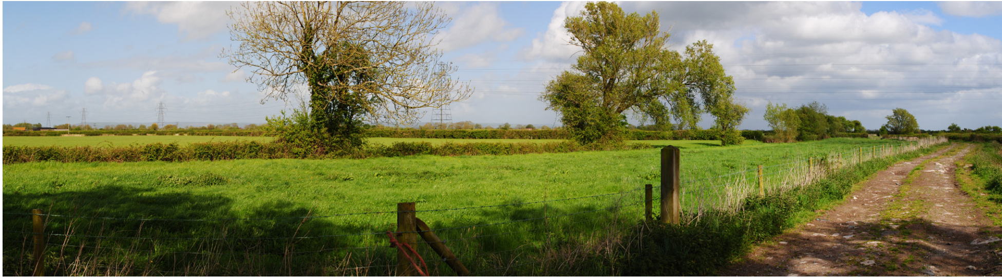
Photograph B1.28: Existing view from PRow BW13/28 looking northeast, east and southeast towards the F Route beyond farmland inbetween intervening trees