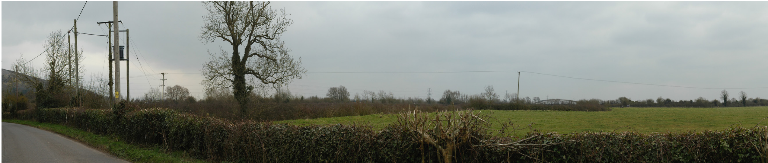
Photograph B1.116: Existing view from adjacent properties on Sevier Road looking south and east across farmland towards the F Route beyond the M5 motorway and towards the road bridge with embankment trees and shrubs screening the proposed cable sealing end compound site