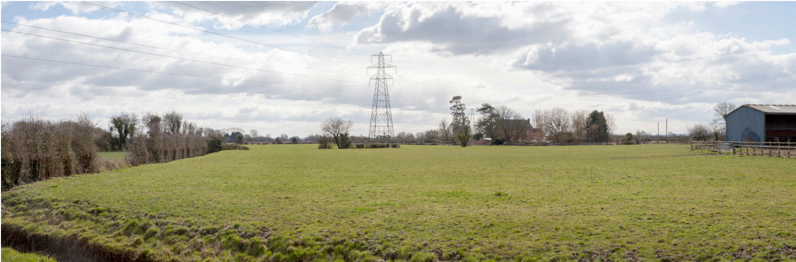
Photograph B1.66: Existing view from PRow AX 23/14 between Vole and Pillrow Wall looking south along the F Route towards Vole Farm on Vole Road and towards the route of the proposed 400kV overhead line beyond