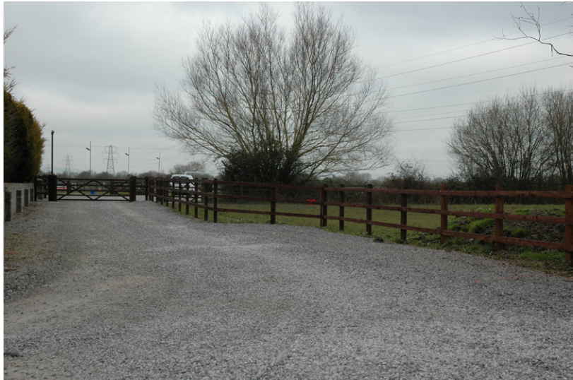
Photograph B1.32: Existing view from Southwick Road at the entrance to Elm Tree Farm looking northeast towards the F Route