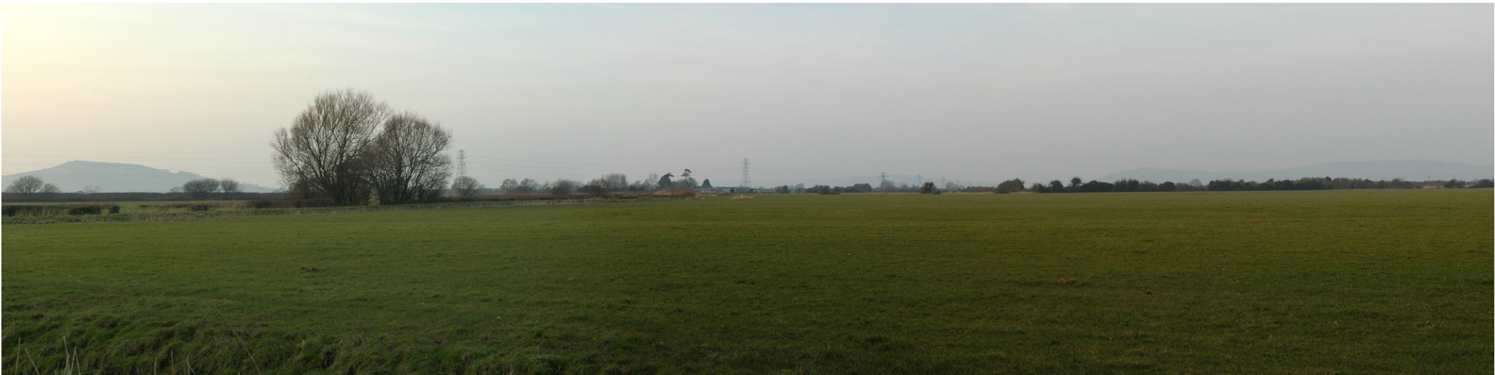
Photograph B1.62: Existing view from Vole Road adjacent a property named Wellfield House looking northwest to northeast across farmland towards the F Route and the route of the proposed 400kV overhead line