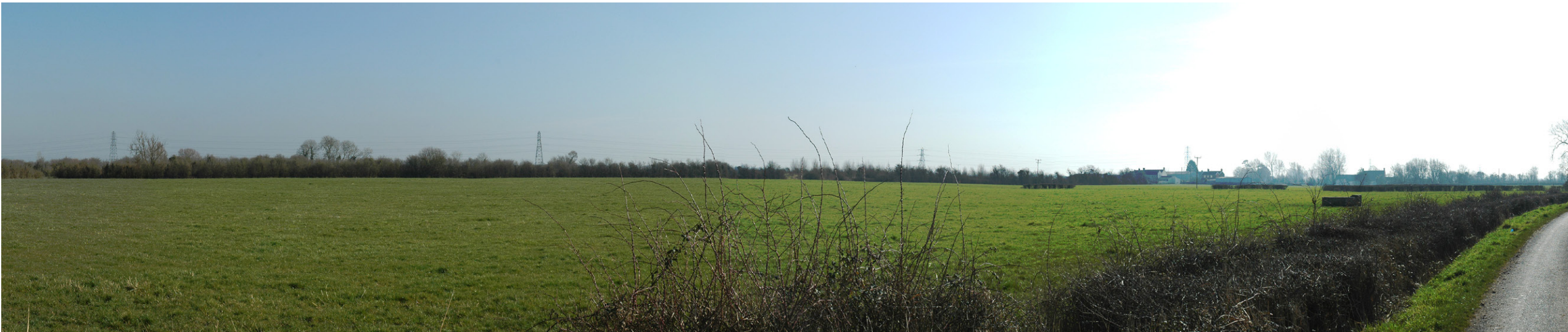
Photograph B1.68: Existing view from Pill Road to the east of Old Vole Farm looking northeast to south across farmland towards the F Route and the route of the proposed 400kV overhead line