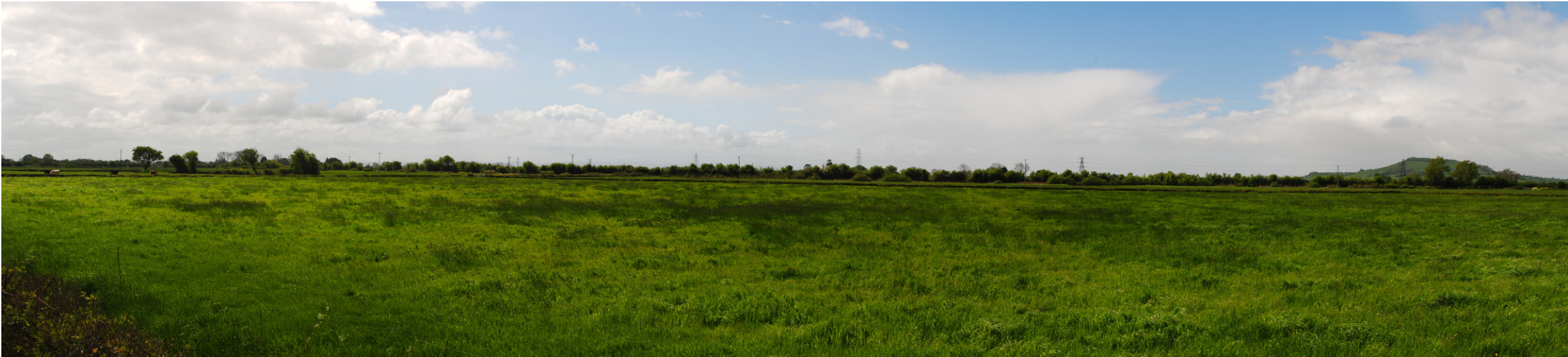
Photograph B1.72 (Part 1) : Existing view from Kingsway near Lower Plaish Farm looking southwest to northwest across fields towards the route of the proposed 400kV overhead line and the F Route beyond