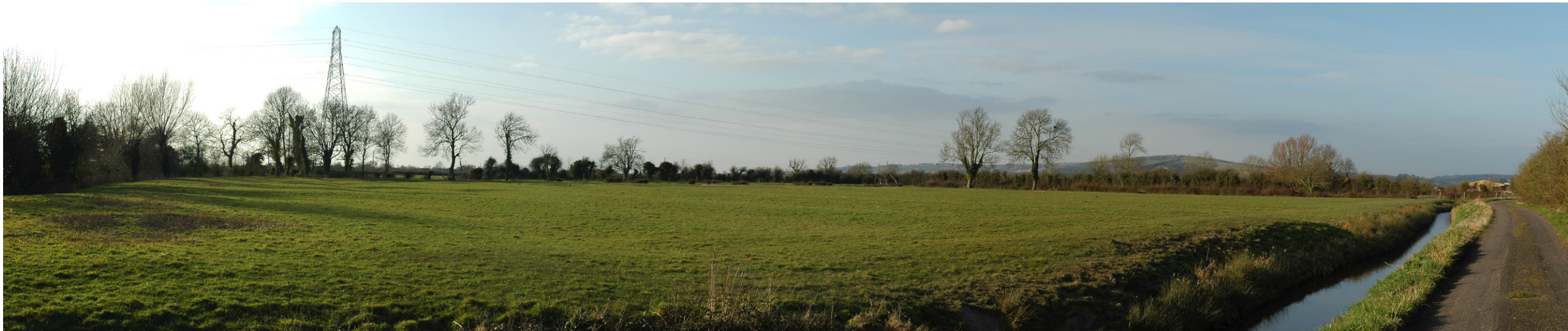
Photograph B1.89: Existing view from Fletcher’s Lane looking west and north towards the F Route and the route of the proposed 400kV overhead line across farmland