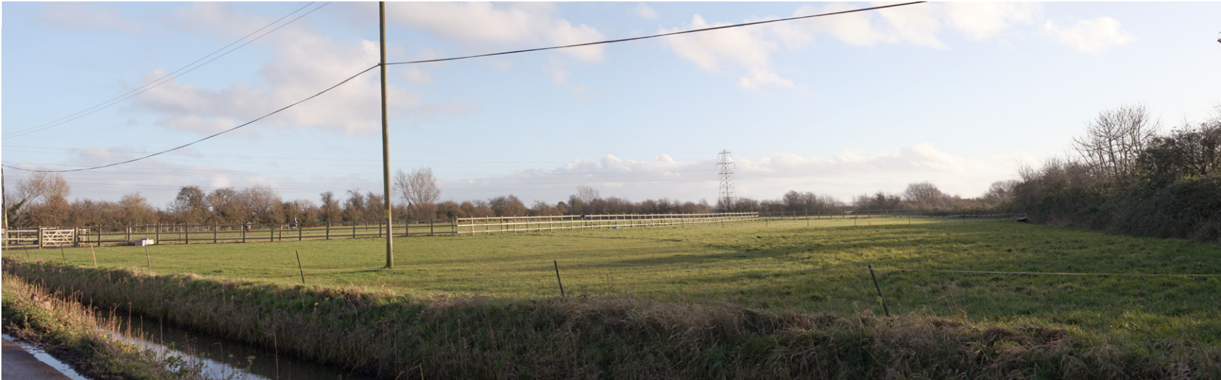
Photograph B1.59a: Existing view from Northwick Road near a property looking southwest towards the F Route beyond farmland and towards the route of the proposed 400kV overhead line beyond