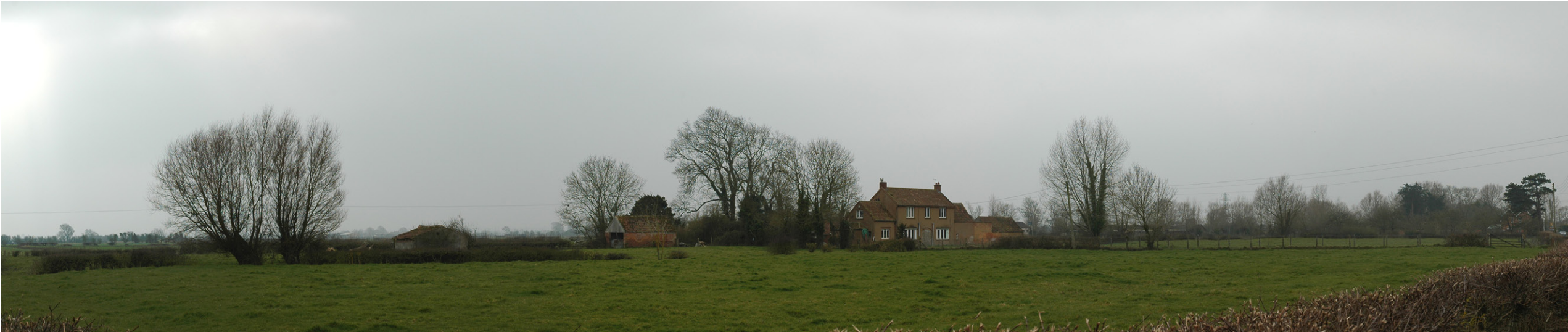
Photograph B1.48 (Part 1): Existing view from Mark Causeway near Court Farm looking south to north towards the route of the proposed 400kV overhead line passing over Mark Causeway and adjacent fields