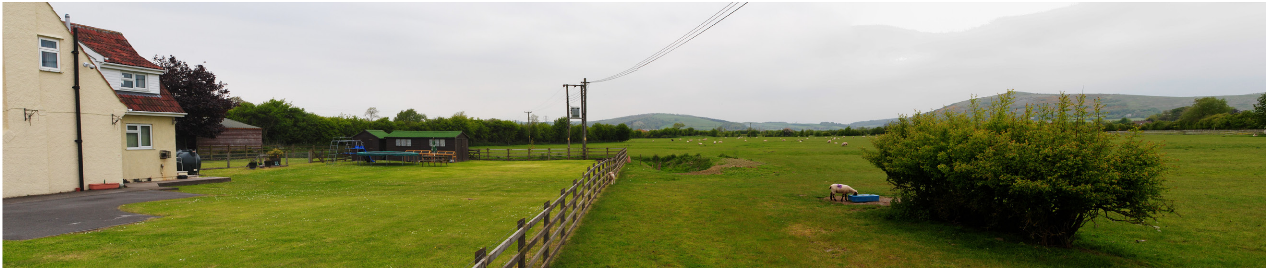
Photograph B1.90: Existing view from the A38 Bristol Road looking north across a property garden towards the F Route and the route of the proposed 400kV overhead line