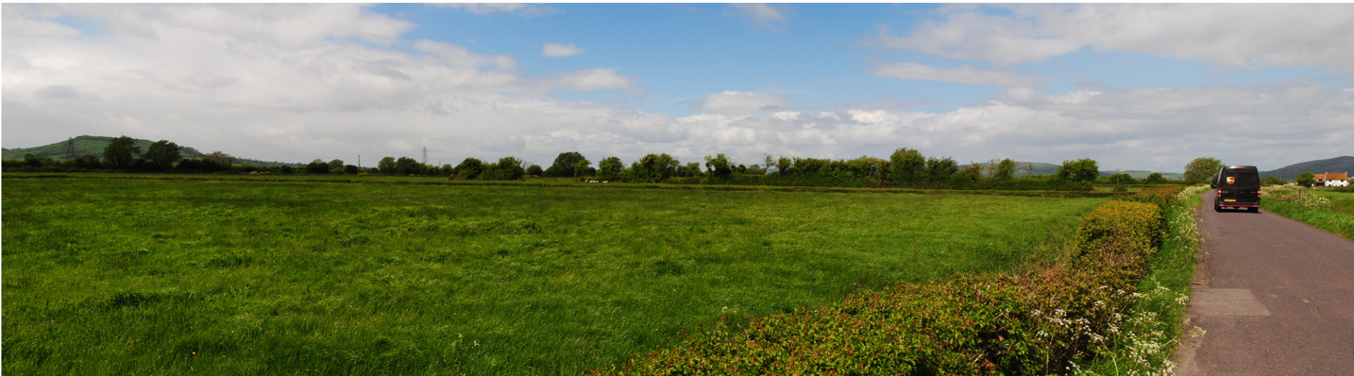
Photograph A1.72 (Part 2): Existing view from Kingsway near Lower Plaish Farm looking southwest to northwest across fields towards the route of the proposed 400kV overhead line and the F Route beyond