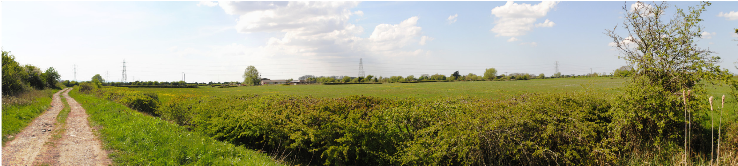
Photograph B1.15: Existing view from PRoW BW 37/13 running along Pyde Drove, looking west and north across farmland towards the F Route and the route of the proposed 400kV overhead line. The existing 400kV Hinkley to Melksham overhead line is visible in the view