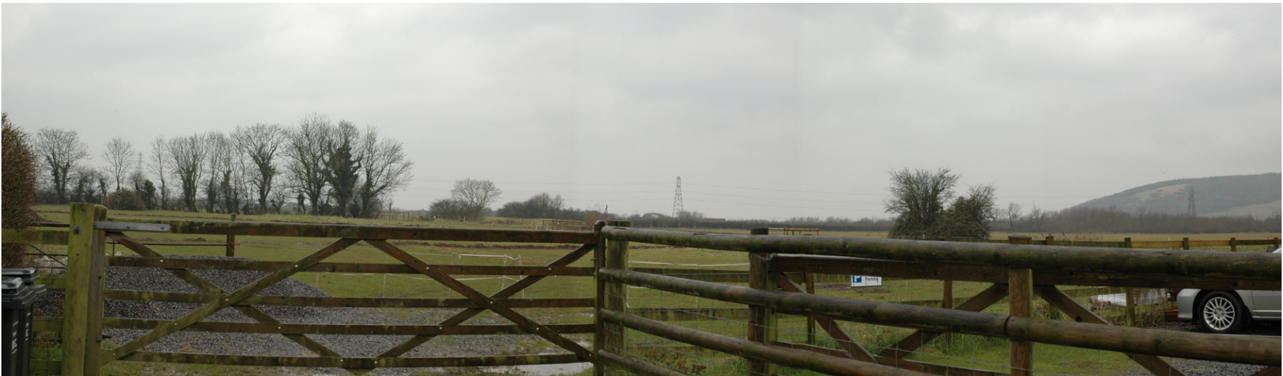
Photograph B1.104: Existing view from Biddisham Lane adjacent Waterfront Farm looking west towards the F Route and the route of the proposed 400kV underground cables partly filtered and screened by trees along the southwestern property boundary