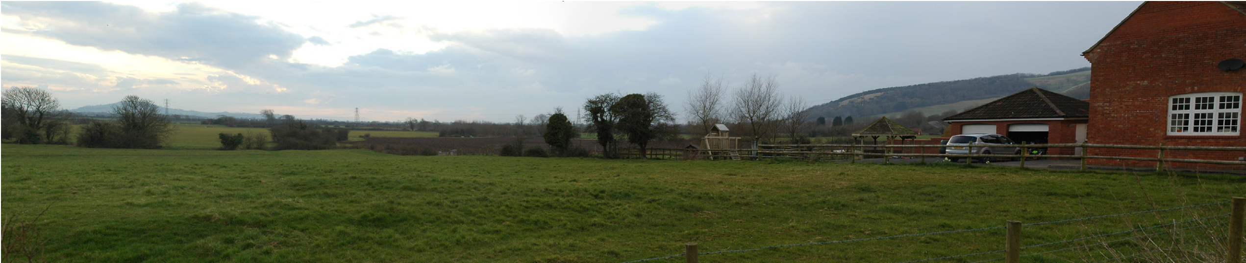
Photograph B1.112: Existing view from adjacent residential property on Kennel Lane looking west and south across farmland towards the F Route and the route of the proposed 400kV underground cables south of the Mendip Hills AONB, above and between intervening field boundary hedgerow and trees