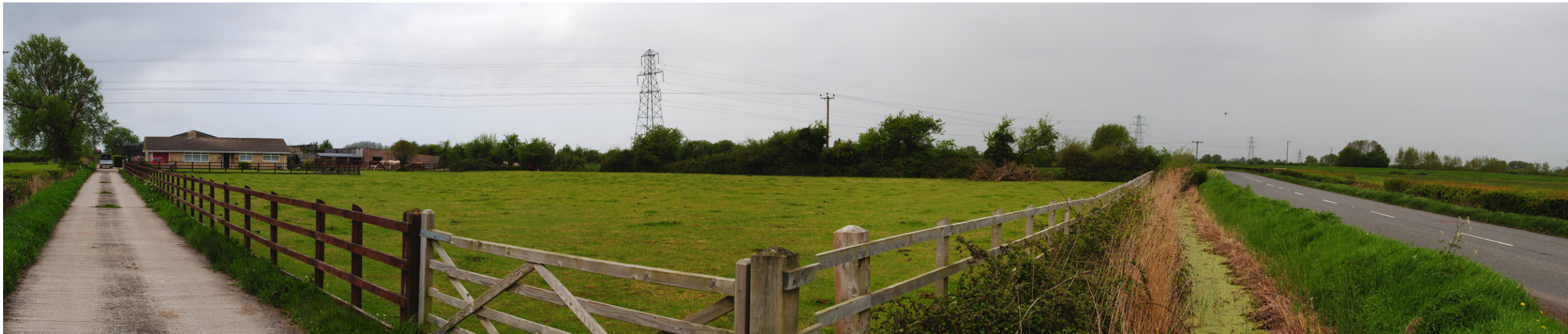
Photograph B1.17: Existing view from the B3139 Causeway at the entrance to Homestead Farm looking west, north and northeast towards the F Route and the route of the proposed 400kV overhead line beyond Homestead Farm, farmland and in the distance beyond the Huntspill River