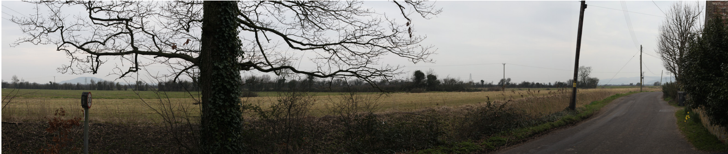
Photograph B1.98: Existing view from Biddisham Lane to north of the entrance to the St John the Baptist Church looking northwest across farmland, with partial filtering and screening by roadside trees, towards the F Route and the route of the proposed 400kV overhead line in the distance above intervening field boundary hedgerow and trees