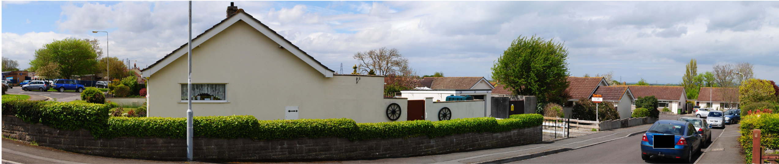
Photograph B1.7: Existing view from The Drive, Woolavington looking west and north above and between residential properties towards the F Route (partly visible) and the route of the proposed 400kV overhead line running across Woolavington Level