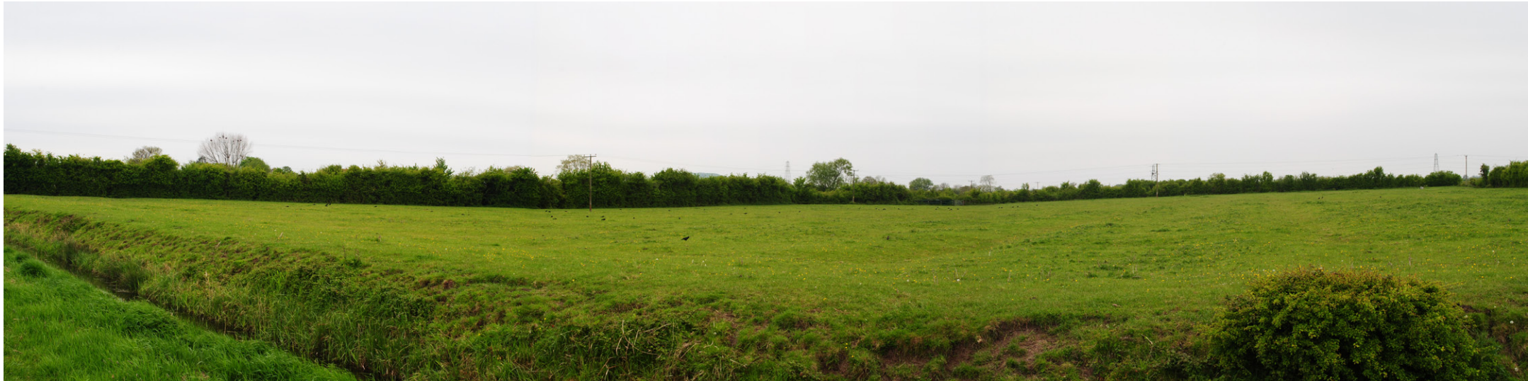
Photograph B1.96 (Part 1): Existing view from PRow AX 2/9 looking southwest to north towards the F Route and the route of the proposed 400kV overhead line beyond farmland and above intervening field boundary hedgerow and trees