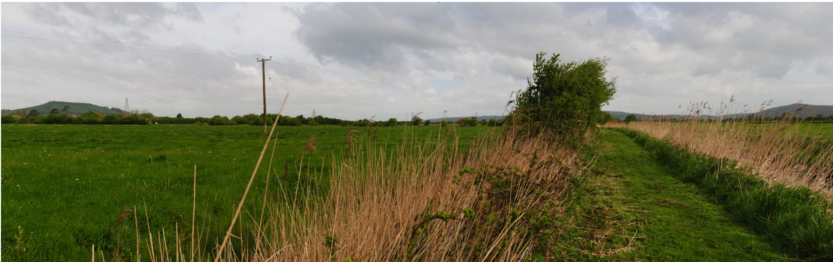
Photograph B1.70 (Part 2): Existing view from PRow AX 23/15 running along Pillrow Wall (Track) looking southwest to northeast across fields towards the route of the proposed 400kV overhead line and the F Route beyond