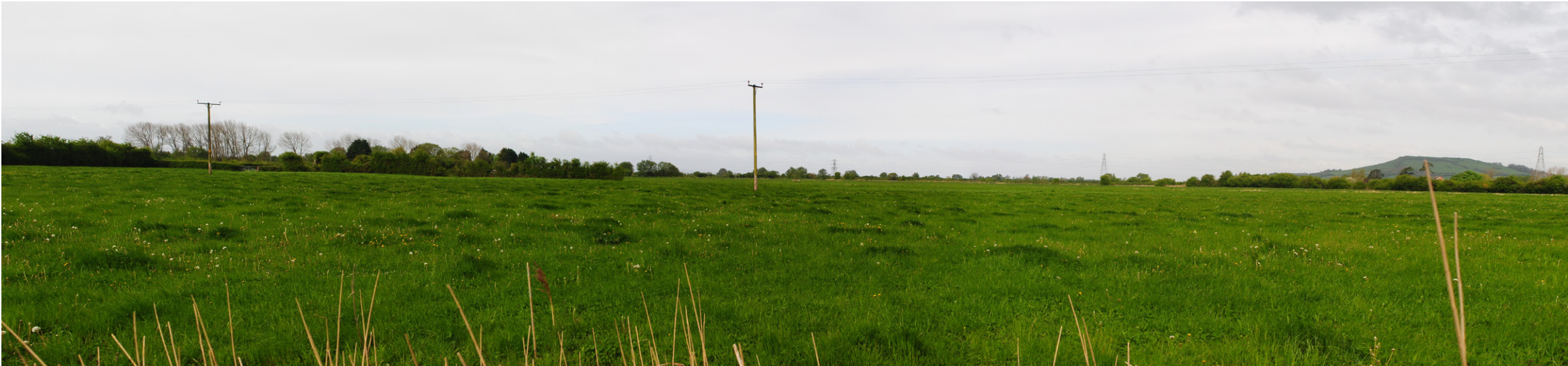
Photograph B1.70 (Part 1): Existing view from PRow AX 23/15 running along Pillrow Wall (Track) looking southwest to northeast across fields towards the route of the proposed 400kV overhead line and the F Route beyond