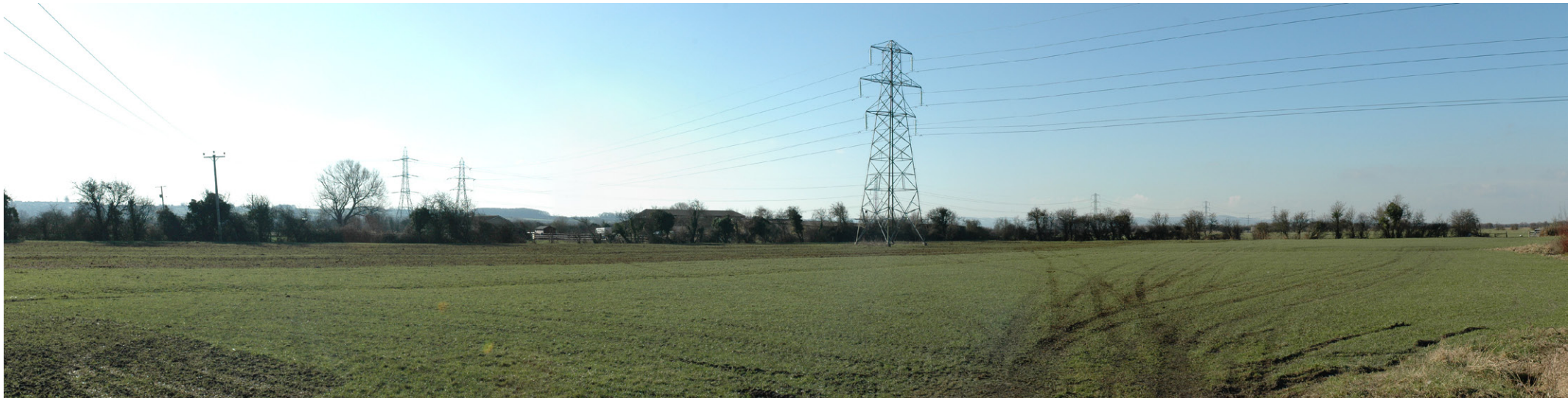
Photograph B1.18a: Existing view from the car park adjacent to the B3139 Causeway and the Huntspill River, looking south towards the F Route and the route of the proposed 400kV overhead line, with the ZG Route beyond and Puriton Ridge in the distance