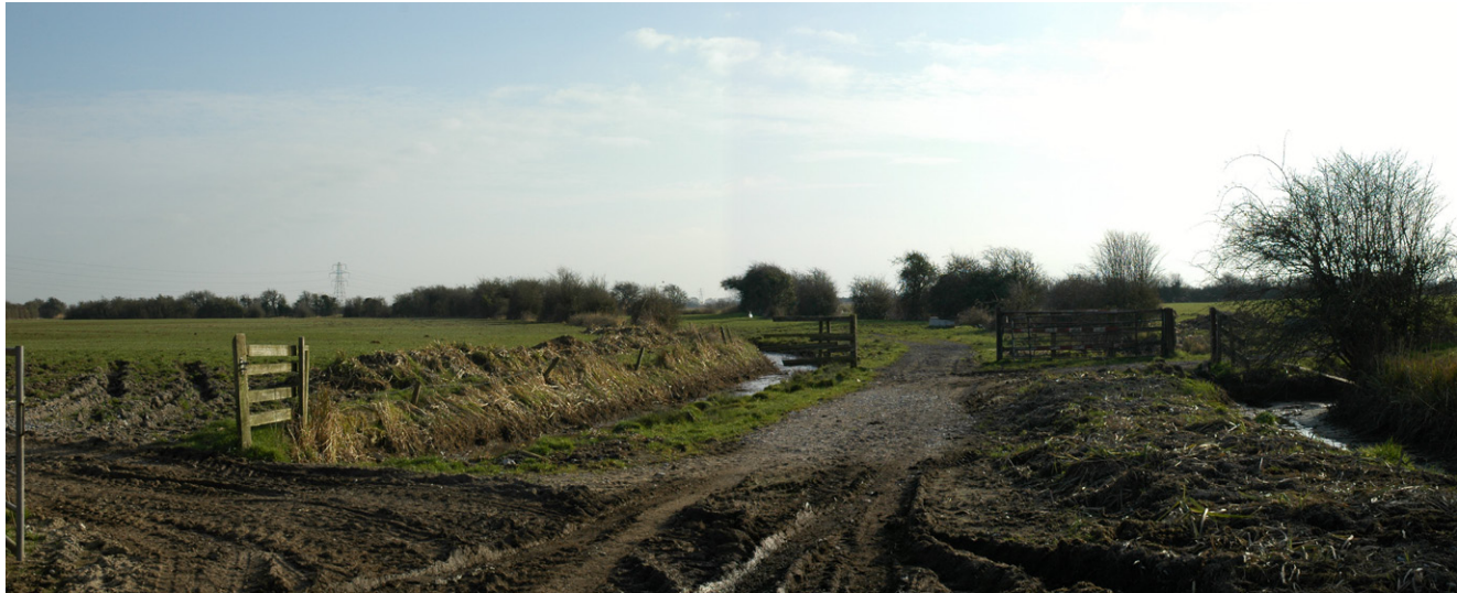
Photograph B1.78: Existing view from PRow AX 17/12 south and southwest of Gills Lane looking south and south west across fields towards the F Route and the route of the proposed 400kV overhead line above and between field hedgerow and trees