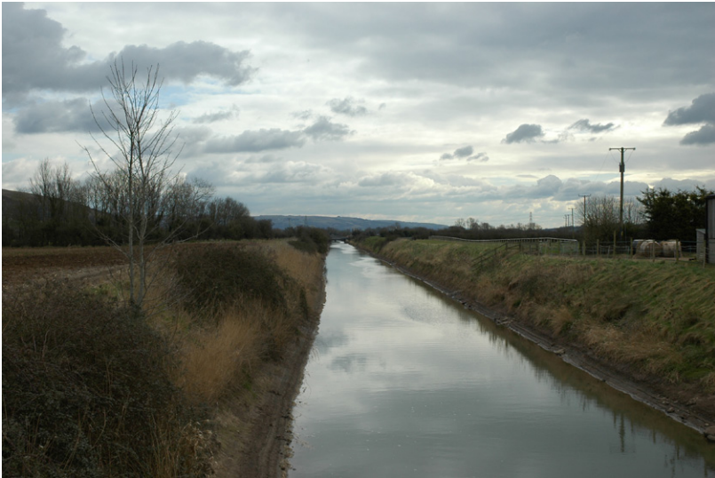
Photograph B1.117: Existing view from White House Lane looking southeast along the River Axe towards the F Route beyond the M5 motorway in the distance