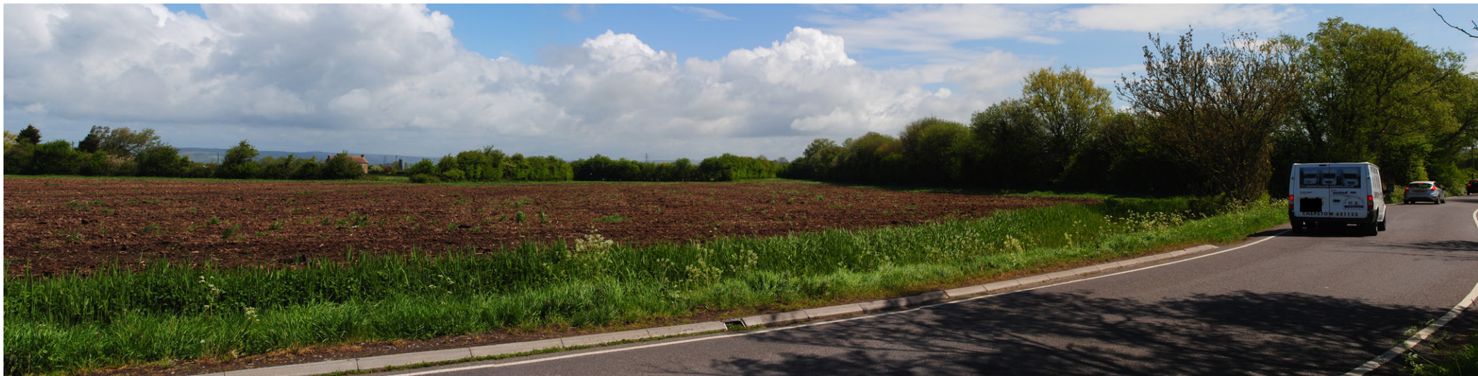
Photograph B1.58: Existing view from Harp Road near Greystones Farm looking east and south towards the F Route beyond farmland and towards the route of the proposed 400kV overhead line beyond