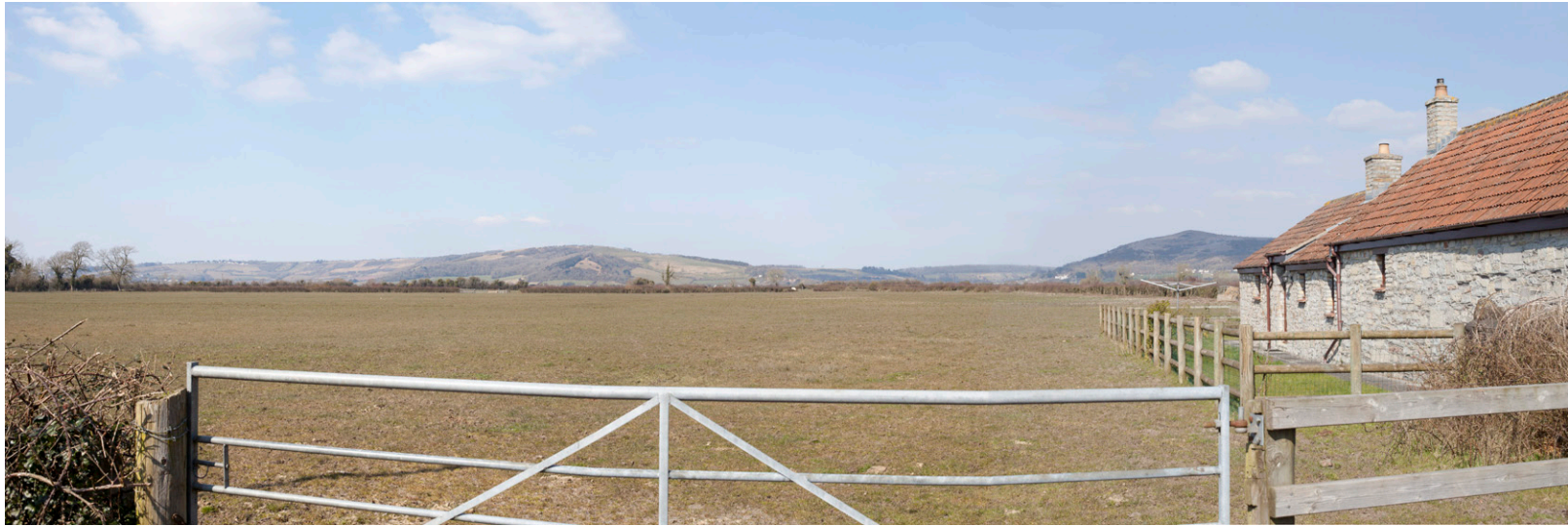
Photograph B1.85: Existing view from Chapel Road in Rooks Bridge near Willow Farm looking north towards the route of the proposed 400kV overhead line and the F Route backgrounded by the Mendip Hills